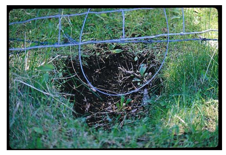
Figure 20. Coyotes that enter a pasture by digging under or crawling through a fence can be taken with a snare encircling the entry hole.

Coyotes that enter a pasture by digging under or crawling through a fence can be taken with a snare encircling the entry hole (Figure 20). The snare should be set on the outside of the fence, which is the direction from which the coyote will approach. Secure the snare to the wire fence by the haywire on the end of the snare. Watch small snare loops within the hole, as they are more easily detected by coyotes.