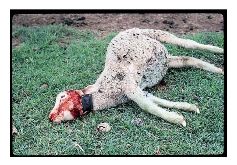
Figure 25. A collar is fitted on a sheep or goat so one bladder is on each side of the throat just under the jaw. A coyote attacking the throat area punctures a bladder and ingests the poison.

A coyote that attacks a collared animal will usually bite and puncture the collar and receive a lethal oral dose of poison. The poison is only delivered to those coyotes that attack a sheep or goat. Thus, the toxic collar is harmless to coyotes not involved in livestock predation and to other non-target species.