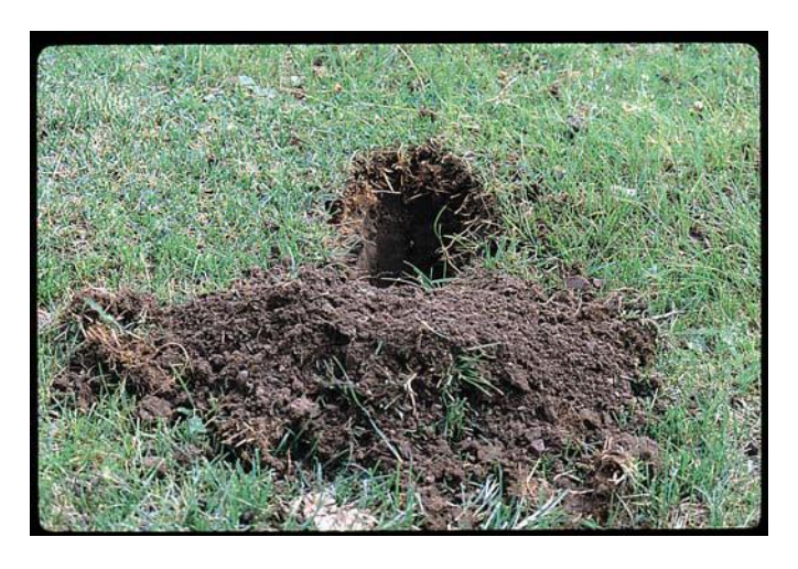
Figure 23. A dig-hole set works very well for applying SLD baits. It mimics the burrow of a rodent.

DO NOT place 1080 in a carcass used as a draw bait when SLD baits are used. Poisoned draw bait will increase the poisoning hazard to scavengers, particularly birds, and is more difficult to dispose of if not totally consumed by coyotes.