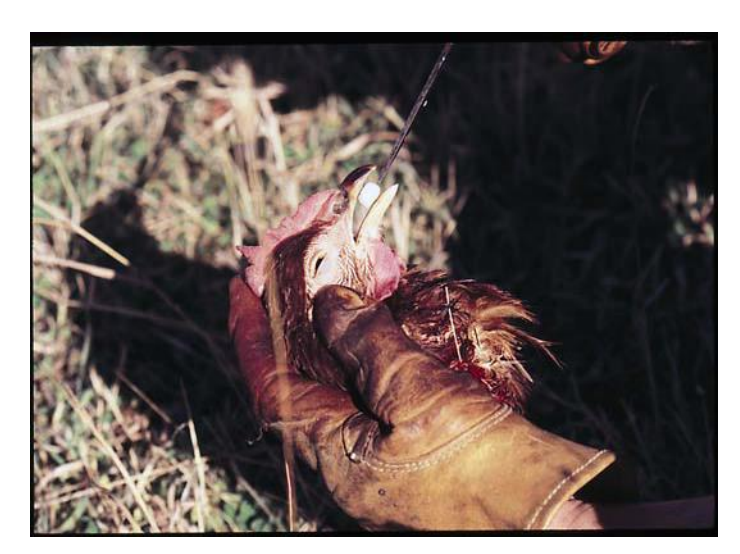
Figure 22. One 1080 tablet placed in a small, bitesized (less than 100 grams) piece of meat makes an SLD bait.

What makes the best SLD bait? One 1080 tablet placed in a small, bite-sized (less than 100 grams) piece of meat makes an SLD bait (Figure 22). A chicken head make an excellent bait at all times of the year and should be used in preference to other bait materials. The beak should be opened and the tablet placed in the throat. Chicken heads are preferred because they are not readily consumed by ants, carrion beetles, or mice. The skull makes effective bait even after the head is dried out or stripped of flesh by insects.