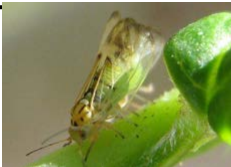
Cottony ash psyllid adult