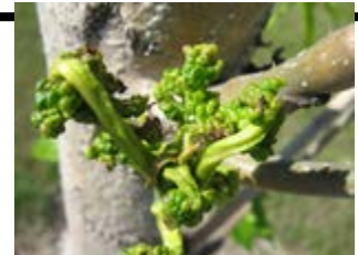
Curled / distorted leaves caused by Cottony ash psyllid nymphal feeding