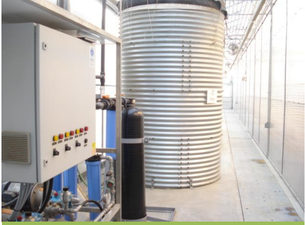
City water: Keep clean water.