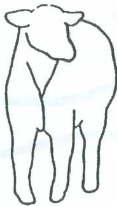
Bowlegged or Pigeon-Toed