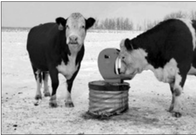
Figure 3. Winterized nose pump