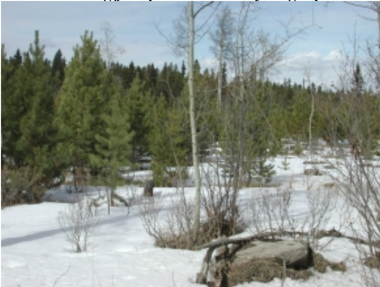
Picture 2. Young jack pine stand with young aspen and white spruce

Jack pine quickly occupies areas where mineral soils have been exposed to major disturbances such as fire if there is seed source are close by. Although fire can easily kill a jack pine stand, it also plays an important role in establishing new stands that result in an even-aged stand. Jack pine trees produce seed every year. However, most of the cones remain closed holding on to their seed until high temperatures such as fire or sun open them. Natural regeneration usually occurs after fire or harvesting. Clear-cutting the pine trees will distribute the seed source evenly over the cut-block. Having the cones close to the ground potentially allows them to experience extreme summer temperatures. A jack pine stand can also be regenerated through planting. However, protection of young jack pine stand from deer, moose, elk, rabbits and other animals may be necessary. Jack pine seedlings require full sunlight to become established. For the first 20 years, its one of fastest growing coniferous species. Jack pine start to show signs of decadence around 75 years of age which is considered as mature forest for jack pine.