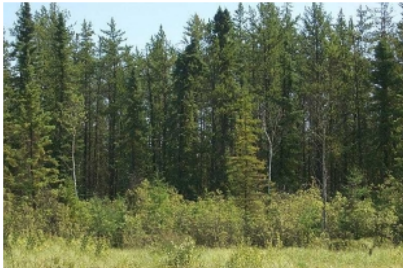
Picture 1. Mature jack pine stand

Jack pine can grow in a wide range of soil types from dry, sandy soil to clay loams but can usually be found in dry acidic sandy soil and in thin soils over bedrock. It is a very wind firm tree except in shallow soils or heavily thinned stands. It is a relatively fast growing medium sized tree and normally reaches between 20 and 25 meters tall. It will not tolerate shade. Common under-story shrubs found in a jack pine stand are prickly rose, bunchberry, bearberry, blueberry, beaked hazelnut and Labrador tea. The groundcover of a jack pine stand usually consists of reindeer lichen and feather moss. It is very susceptible to severe losses from fire, insects, disease as well as browsing by deer or moose. Many insects and diseases are attacking jack pine trees but dwarf mistletoe is the most recognizable disease to the landowners.