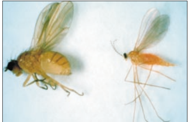
Figure 6. Lauxanid, Camptoprosopella borealis (left) and wheat midge (right)

Not every small fly in the crop will be a wheat midge. The wheat midge may be mistaken for lauxanid, another small fly that is common in wheat (Figure 6).