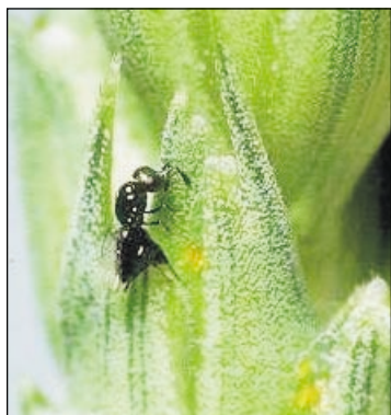
Figure 7. Female (with midge eggs)

On the prairies, wheat midge populations are often held in check by a small, 1 to 2 mm (1/25-1/12 inches) long parasitic wasp called Macroglenes penetrans (Kirby) (Figure 7). In southern B.C., another small parasitic wasp, Euxestonotus error (Fitch) attacks the wheat midge similar to M. penetrans .