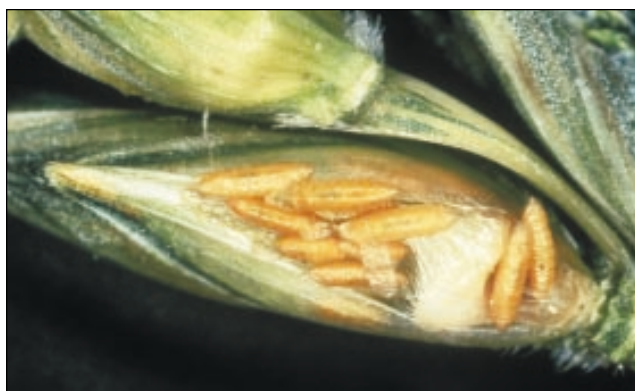
Figure 2. Wheat midge larvae feeding on developing wheat kernel. Top: early stage of kernel development. Bottom: mature larvae – kernel severely damaged

Larvae feed and develop for two to three weeks, growing to 2 to 3 mm in length, before crawling off the wheat head to find their way to the ground and bury themselves in the soil.