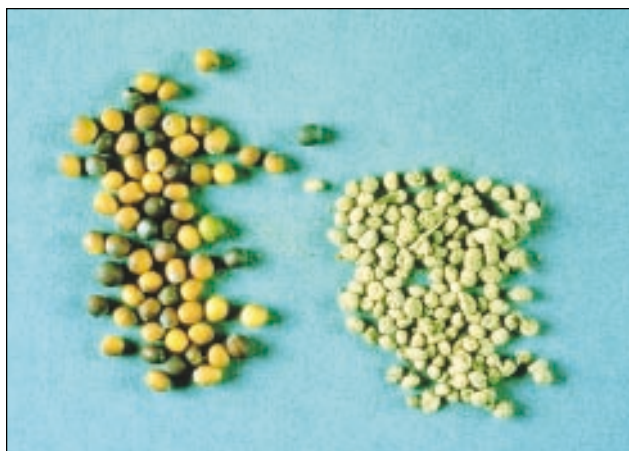
Figure 3. Canola seeds (left) and wheat midge cocoons (right)

Most larvae remain within the top 5 cm (2 inches) of soil, but some may burrow 10 cm (4 inches) below the soil surface. The larvae spin round cocoons that are about half the size of a Polish-type canola seed. (Figure 3). Over-wintering larvae may remain dormant until conditions are favourable for development, whether that is the following spring or several years later.