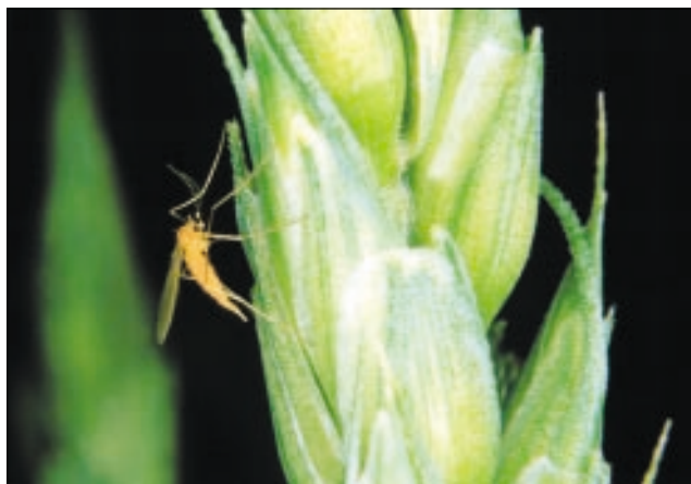
Figure 1. Side view of the wheat midge resting on wheat spikelets

The wheat midge ( Sitodiplosis mosellana ) is found in most areas around the world wherever wheat is grown (Figure 1). In recent years, significant damage to wheat crops has been reported in Alberta, Saskatchewan, Manitoba, southern British Columbia, Minnesota, North Dakota and Idaho.