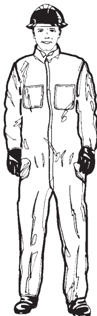
Table 1. Protective Clothing Requirements