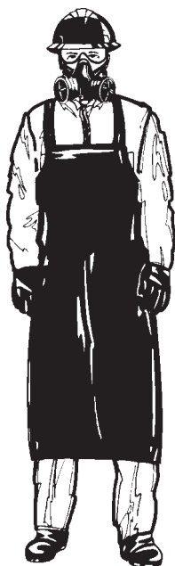
Table 2. Clothing for Extra Protection

You need extra protection (see Table 2 Clothing for Extra Protection) when you mix, load and handle pesticide concentrates, as well as when you work with highly toxic pesticides. Check the pesticide label to identify when extra protection is necessary. Make sure your clothing and equipment is recommended and not worn out or malfunctioning.