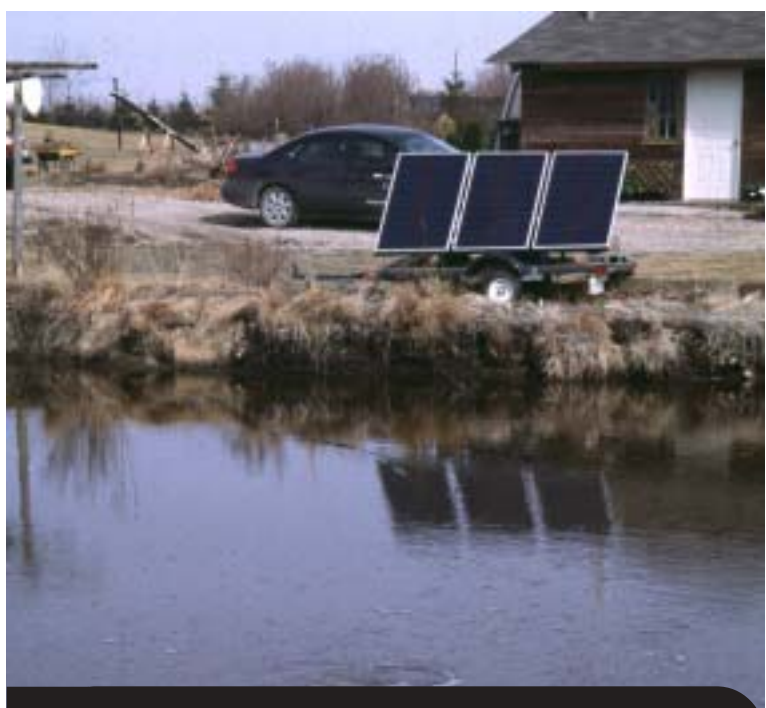
Solar powered aeration installed on a trailer allows for mobility