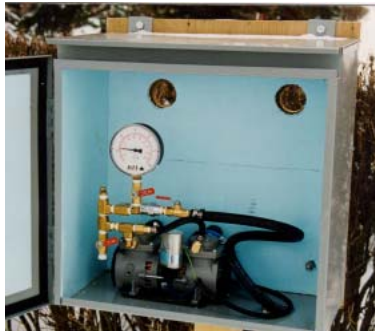
A compressor with the pressure gauge and the pressure release valve installed at a dugout

Small diaphragm compressors work best for dugout aeration because they perform well at the pressure ranges (up to 15 to 20 psi) needed to aerate dugouts. An air compressor of 1/4 to 1/8 hp putting out about 1 cubic foot per minute (cfm) is sufficient to aerate a dugout up to 5 million litres (1 million gallons). Several manufacturers produce suitable compressors which are available in Western Canada at farm supply stores. These compressors, which have a low power demand (100-200 watts), should run continuously.