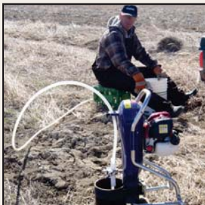
Monitoring well purging