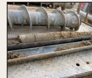
Hollow stem and split spoon

Data collection includes groundwater elevation, vertical and horizontal flow, chemistry, and isotopes, as well as manure and soil characteristics.