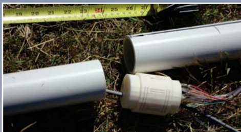
Point velocity probe used to measure groundwater velocity and direction at the centimetre scale.