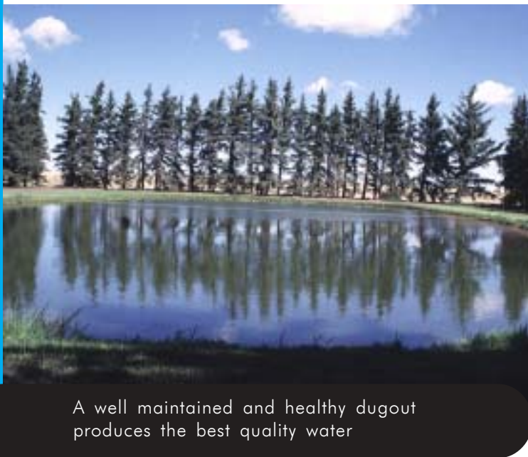
A well maintained and healthy dugout produces the best quality water

Dugouts are miniature ecosystems, containing all forms of life including plants, animals and bacteria. All of these living organisms require oxygen, so an adequate concentration of oxygen in the water is required to maintain a healthy dugout ecosystem. A healthy dugout produces the best quality water.