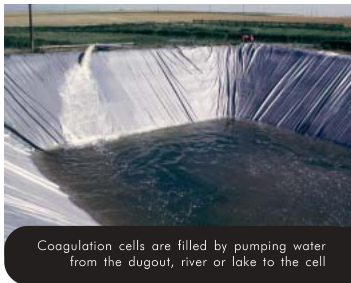
Coagulation cells are filled by pumping water from the dugout, river or lake to the cell

The commercial coagulation system uses a batch coagulation process. Water is treated every three hours until the storage tank is full. This system costs about $6,000 and is easy to operate, but requires the use of special chemicals.