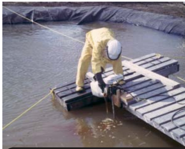
Aluminum sulphate and ferric chloride are the primary coagulant chemicals used in coagulation cells

In a coagulation cell, the sludge should be removed annually. Fall is the best time to remove sludge. The sludge can be safely applied on an adjacent field or pasture. Studies have shown no crop yield reduction or detectable residues in the crop following heavy sludge application rates.