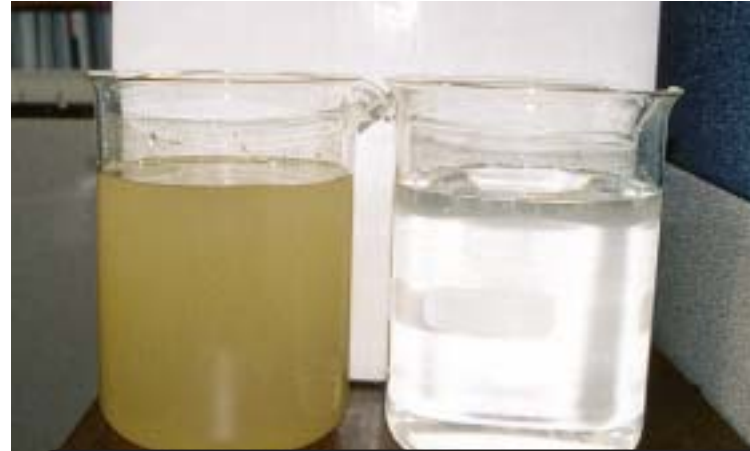
Samples of dugout water before and after coagulation show a dramatic improvement in water clarity