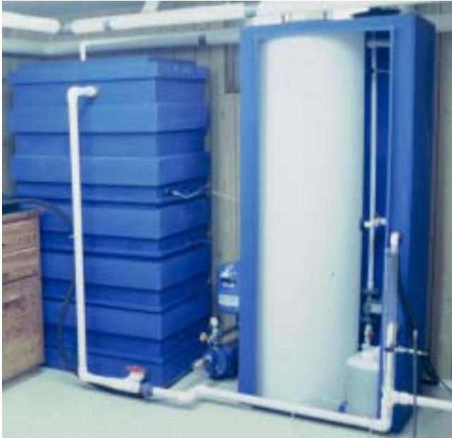
The commercial coagulation system uses a cylindrical mixing and settling tank, chemical injector pump, controller and holding tank to treat the water