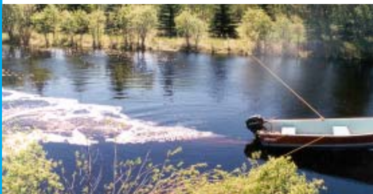
Dugout coagulation can be achieved by mooring the boat and pumping chemicals downstream of the boat motor propeller

A coagulation cell has an inverted pyramid shape. Cells for household water supplies are designed to hold approximately 250,000 litres or 55,000 gallons (equivalent to about six months of domestic water needs). Of course, larger cells can be built for other agricultural uses.