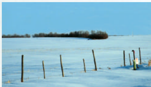
Shelterbelt in background traps snow

Properly planned field shelterbelts trap snow, reduce evapotranspiration, provide wildlife habitat and protect adjacent soil and crops from wind. Researchers from Saskatchewan, Manitoba, North and South Dakota concluded that wheat yields increased an average of three and a half percent on fields sheltered by mature shelterbelts. This includes land taken out of production for shelterbelt planting and competition of the shelterbelt with the crop.