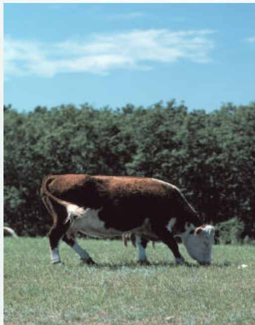
Cow Grazing with shelterbelt in background

Other CO 2 emission reductions from agroforestry practices result from reduced heating requirements for farmsteads, reduced fuel, fertilizer and machinery costs compared to conventional inputs of annual crop production, and less snow removal.