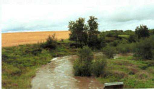
Creek riparian area

understand interactions between trees and agricultural crops. Intercropping in Alberta is most feasible with hybrid poplar and barley or wheat.