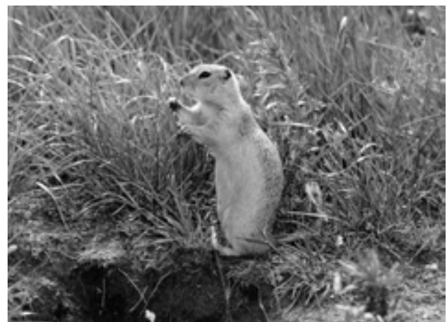
Figure 1. Richardson's ground squirrel

The Richardson's ground squirrel is a burrowing rodent found throughout most of the prairie and parkland regions of Alberta (Figure 1). It is the most common ground squirrel of the five species found in Alberta. The other species are Franklin's (bush gopher), Columbian, thirteen-lined and golden-mantled. The Richardson's ground squirrels are the most prevalent colony dwellers of the five species.