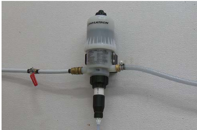
Figure 3. Automatic pump