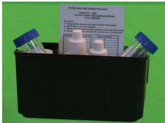
Figure 4. Test kits

Inexpensive titration test kits are available from industry suppliers.