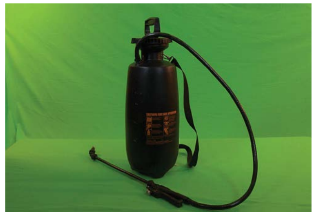
Figure 2 Hand applicator