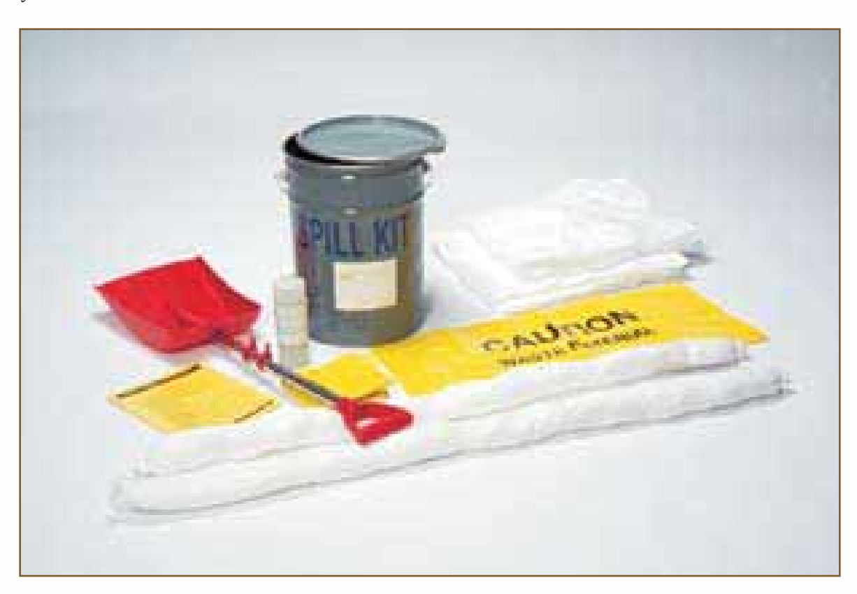
Figure 23: Emergency spill kit