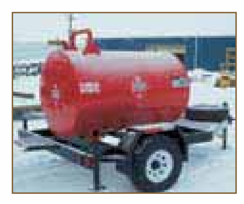
Figure 8: Portable tank with proper signage, etc.