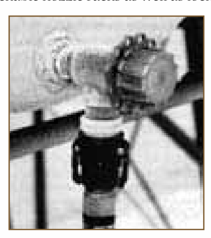
Figure 6: Cam lock fitting