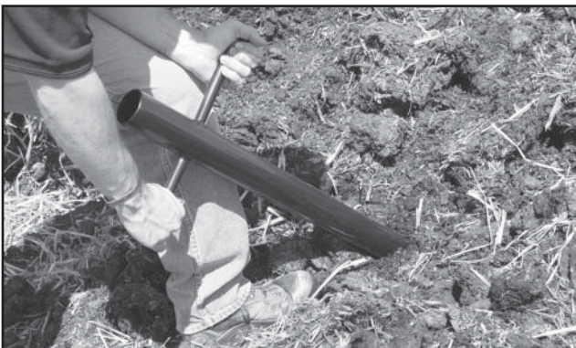
Figure 3a, 3b. Solid manure-sampling probe