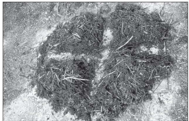
Figure 1. Dividing a pile manure into four sections

Alternatively, manure can be collected during field application. To do this, place a minimum of three tarps,