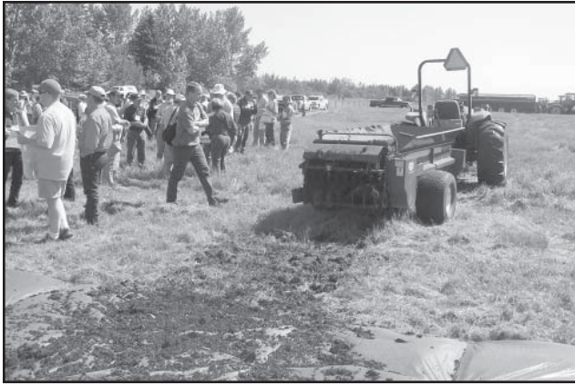
Figure 2. Collecting manure with a tarp

with more recommended for very large areas, across the field, so the tarps can catch the manure from several applicator passes. Collect samples from the entire application process. Although messy, this method of collection can provide a real estimate of the nitrogen applied after handling and application volatilization losses have occurred.