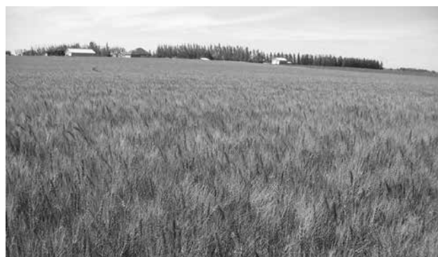
Figure 2. A well-irrigated winter wheat crop (variety: Radiant) near Lethbridge, Alberta, on August 18, 2009 (96 bu/ac).

About 80 mm of water is required to carry winter wheat from soft dough to physiologic maturity in southern Alberta. No irrigation water is needed once the heads have completely turned colour from green to brown since the crop is mature at this point and yields have been established (Figure 2).