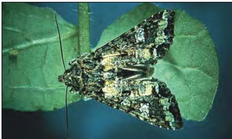
Bertha armyworm moth identification