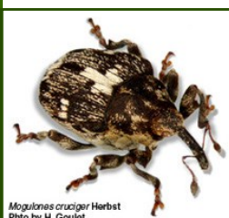
Mogulones crucifer Herbst

Hound's tongue has one agent - a root mining weevil called Mogulones crucifer (formerly cruciger ). One release of these agents was made in 2008 and again in 2009 in the south end of the Porcupine Hills. Monitoring of these releases last season found the weevils still present and the plant population greatly reduced. M. crucifer is a very successful agent in that they will decimate a hound's tongue population before dispersing. Four more releases of this agent were made this year – two in the Castle and two more in the Porcupine Hills. These releases will be monitored annually and eventually collected from for redistribution. These agents were obtained from Agriculture and Agri-food Canada (AAFC), Lethbridge.