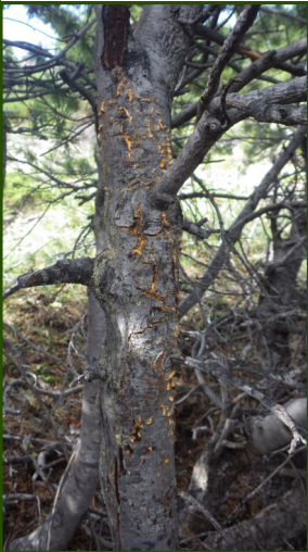
Orange blister rust canker on tree.

W hitebark and limber pines are listed as Endangered in Alberta under the Wildlife Act. Whitebark pine is listed as Endangered federally under the Species at Risk Act with limber pine anticipated to follow in 2015. These high elevation five-needle pines are both under threat across their range by an invasive fungus (white pine blister rust), mountain pine beetle, fire exclusion and climate change. Loss of these species is expected to have adverse effects on the ecosystems in which they occur due to their important roles in colonizing disturbed sites, retaining snowpack, and providing high-energy food for wildlife due to their large seeds.