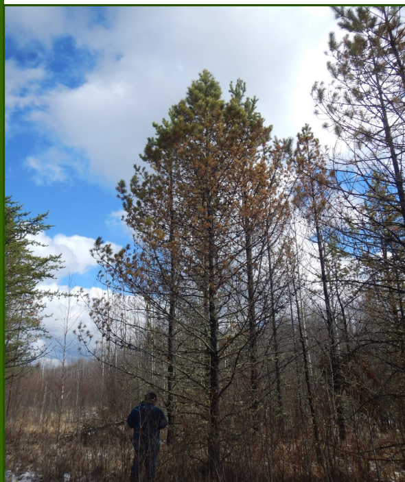
Lodgepole pine infected by Dothistroma in a genetic test near Calling Lake (photo Ashley Romano).

The main goals of this project are to confirm Dothistroma infections (the disease is often difficult to diagnose) and determine how similar are the Dothistroma strains found in different locations in AB and BC. This information will aid the development of a suitable mitigation strategy and control program. The final results are expected in April 2015.