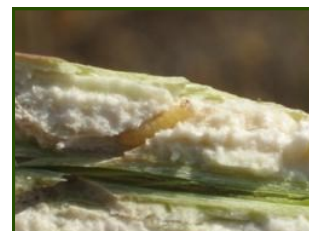
Larvae stem damage

There have been repeated attempts to establish a toadflax stem-mining weevil, Mecinus janthinus , in Alberta but the warm temperatures associated with chinooks have played havoc with insect emergence. Small populations have become established in central Alberta. In an attempt to mass rear these insects, common toadflax plants were collected from the Castle area near the Crowsnest Pass and insects collected from established sites have spent the summer in a tent in Sundre. Females oviposit into the stems and the larvae feed in the stems during development and then emerge as adults the next growing season. Stems of the tent plants will be collected in the fall and refrigerated over the winter. Next season the emerging weevils will be released in the Castle area.