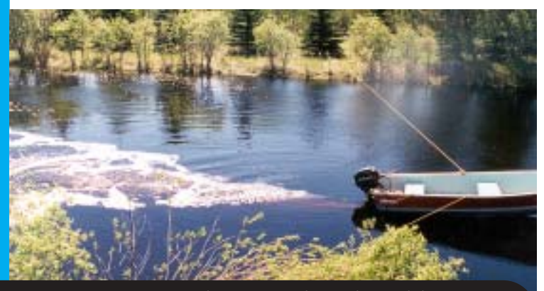
Dugout coagulation can be achieved by mooring the boat and pumping chemicals downstream of the boat motor propeller

A coagulation cell has an inverted pyramid shape. Cells for household water supplies are designed to hold approximately 250,000 litres or 55,000 gallons (equivalent to about six months of domestic water needs). Of course, larger cells can be built for other agricultural uses.