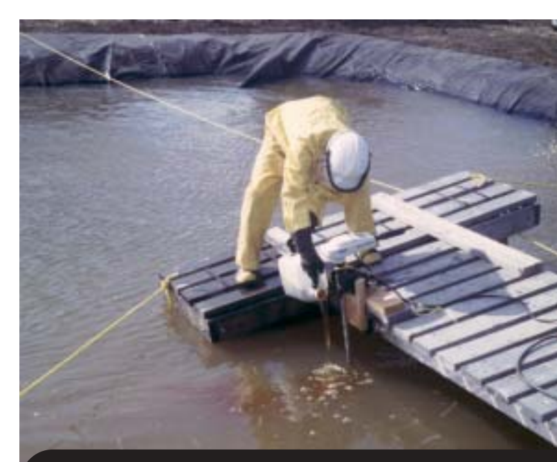
Aluminum sulphate and ferric chloride are the primary coagulant chemicals used in coagulation cells

In a coagulation cell, the sludge should be removed annually. Fall is the best time to remove sludge. The sludge can be safely applied on an adjacent field or pasture. Studies have shown no crop yield reduction or detectable residues in the crop following heavy sludge application rates.