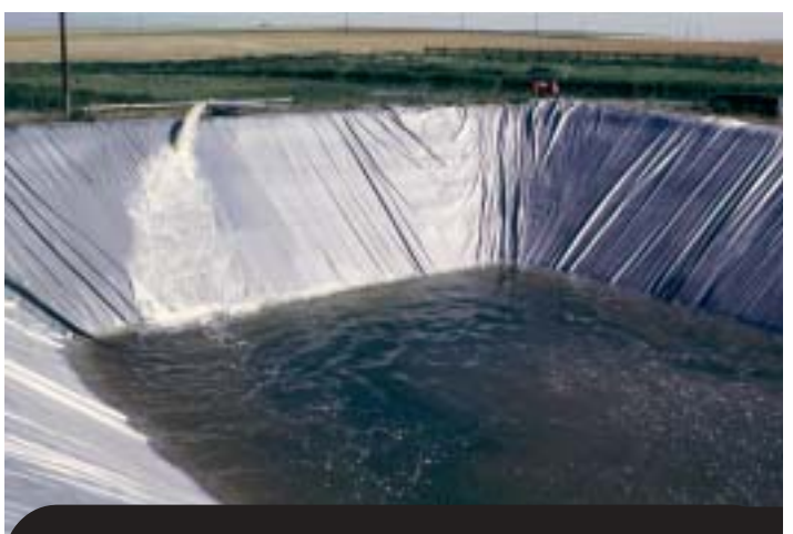
Coagulation cells are filled by pumping water from the dugout, river or lake to the cell

The commercial coagulation system uses a batch coagulation process. Water is treated every three hours until the storage tank is full. This system costs about $6,000 and is easy to operate, but requires the use of special chemicals.