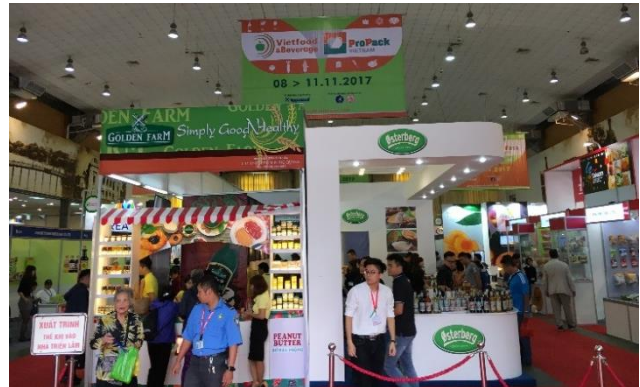
Viet Food and Beverage Show in Hanoi

"For Alberta food industry suppliers, the best prospects for success include food ingredients for further processing, beef, frozen french fries, malting barley, cereal grains, pulses and lentils, baby food, health supplements and functional foods."