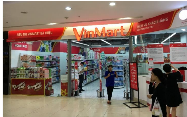
Entrance to VinMart – a major Vietnamese retailer of imported food and consumer products