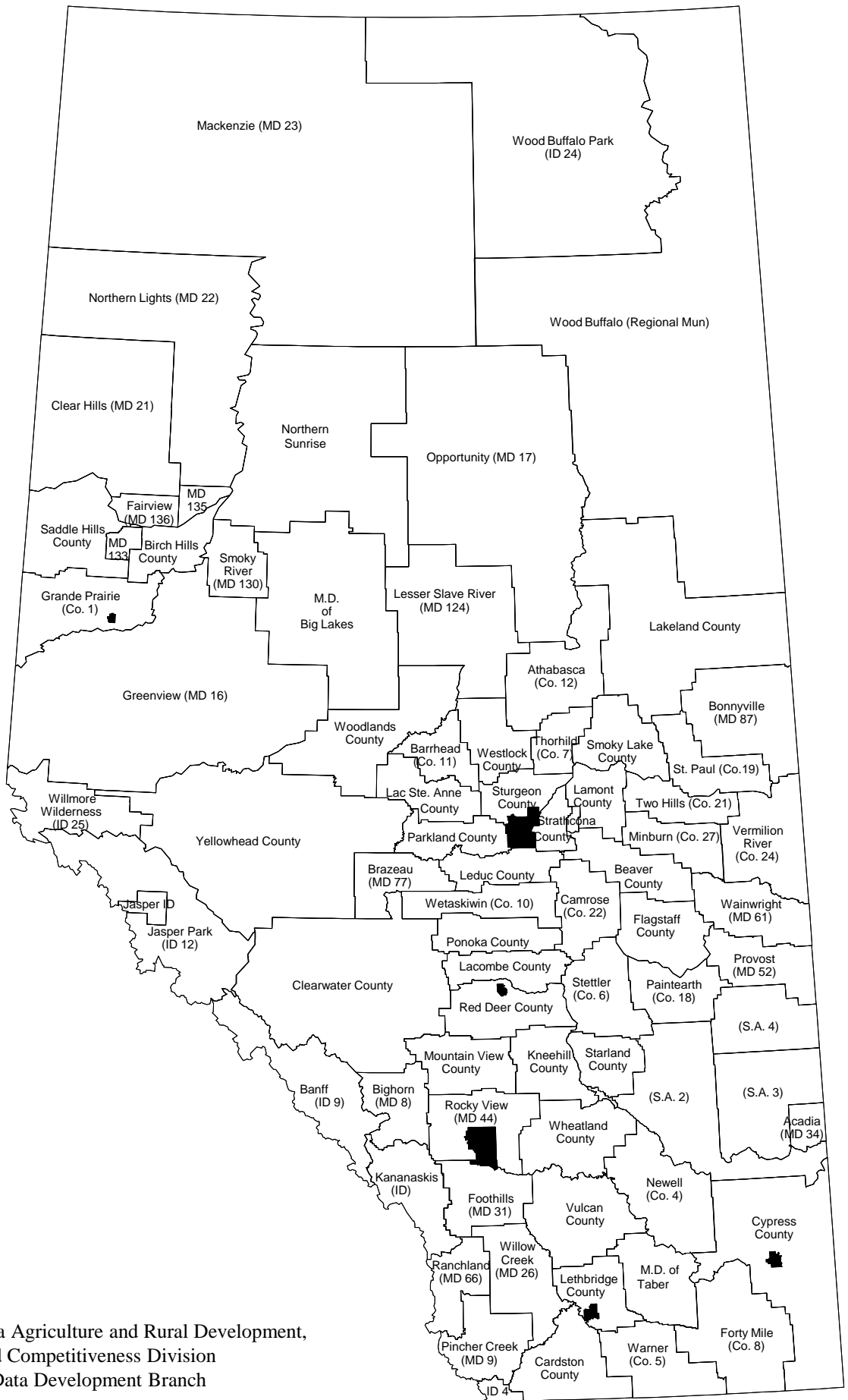
Source: Alberta Agriculture and Rural Development, Economics and Competitiveness Division Statistics and Data Development Branch