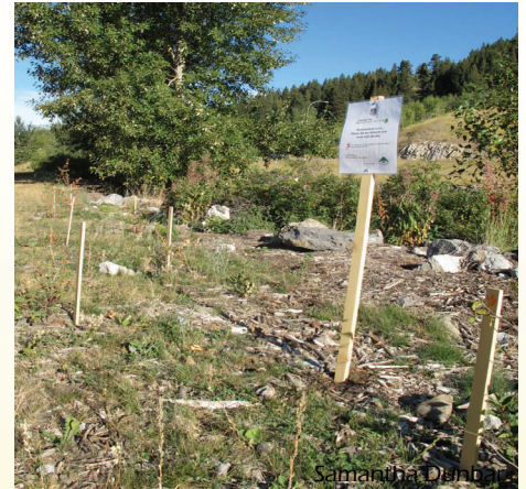
Riparian restoration in Riverside Memorial park in Blairmore

This work has been made possible through a grant from the Alberta Conservation Association .