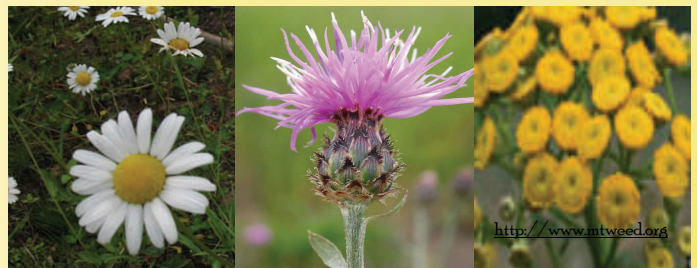
Oxeye Daisy Noxious