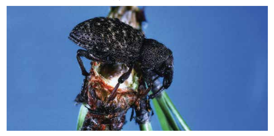
4.3.9 Warren rootcollar weevil (Hylobius warreni Wood)

Warren rootcollar weevil is a native insect widely distributed in Alberta's forests. Its prime hosts include lodgepole and jack pines, but other pine species such as Scotch pine are readily attacked. Spruce species are also hosts but are less commonly attacked than pine species in Alberta (Cerezke 1994). This weevil attacks healthy trees from a few years old to maturity, but its injury has greatest impact in stands less than 30 years old. Feeding damage by larvae occurs in the root collar zone, either on the lower stem or on main lateral roots, and results in various circumferential amounts of partial girdling of the tree stem or roots (Cerezke 1994). Weevil-caused tree mortality occurs in natural stands up to about the age of 30 years, but appears to peak between 5 and 10 years (Ives and Rentz 1993). Accumulated tree mortality from girdling injury often ranges from 5 per cent to 10 per cent, but can exceed 15 per cent in intensively managed stands and plantations (Cerezke 1994). Trees that survive various levels of partial girdling have slightly reduced radial growth, while height growth reductions are more significant, and can range from 10 per cent to 30 per cent post-attack (Cerezke 1994).