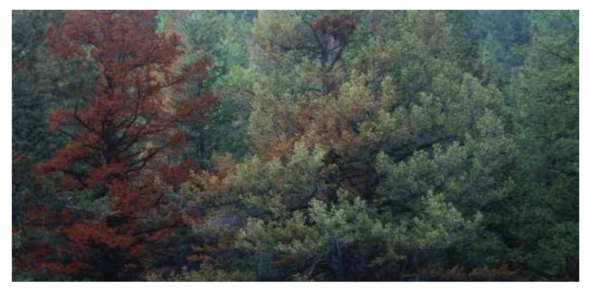
4.3.8 Douglas-fir beetle (Dendroctonus pseudotsugae Hopkins)

Projections of future habitat suitability of Douglas-fir distribution in Alberta carry large uncertainties according to Gray and Hamann (2011), and therefore projections of the western spruce budworm beyond 2020 could be highly speculative at this time.