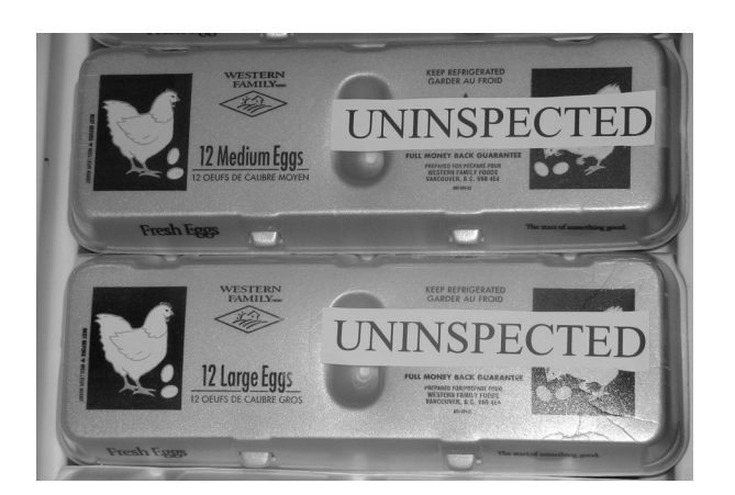
Figure 7.3 Properly Labelled Used Egg Carton

Egg containers can be recycled provided they are clean and free of contaminants. If uninspected eggs are sold in recycled cartons, any information relating to the grade or a grading station must be covered up.