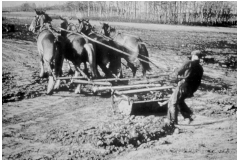
Figure 1-1 Horse-Drawn Excavation

During the drought of the 1930s, Prairie Farm Rehabilitation Administration (PFRA) helped establish design standards for dugouts to make them a more reliable source of water. They also began offering financial incentives to producers who constructed dugouts according to prescribed design standards. Since the 1930s, PFRA and other government agencies have worked to improve the basic design of the farm dugout. More than 250,000 dugouts have been constructed on the Prairies over the last 100 years.