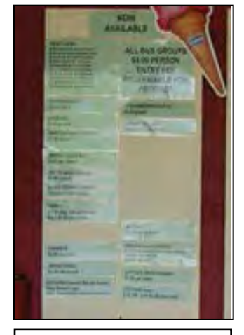
Pricing sign – The Garden –Calgary, AB

Pet restriction – E.L.K.S. Vegetable & Berry Farm – St Albert, AB