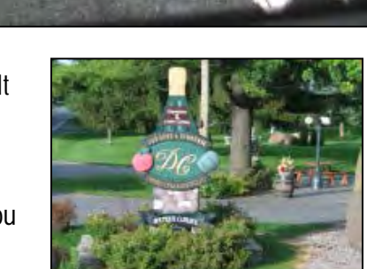
Verger Denis Charboneau – Mont Saint Grégoire, Québec

Your entrance should be clearly visible and obvious. Some operations have their entrance in a wide open space, which (in theory) makes it easier for people to see the farm; however, in these cases you should consider the value of a constructed gateway framing the entrance to your operation. In operations where the entrance is more enclosed (e.g. by trees, etc.), it is even more important to "frame" the entrance so that your customers can clearly see where to turn. Entrances should direct your customers to where they need to go, whether parking, sales or production areas.