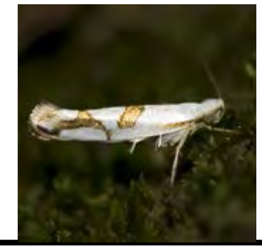
Cherry Shoot Borer – adult

Prune out dying shoots as they are observed