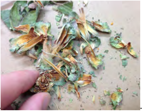
Taking apart the gall reveals a tiny white larva at the exact centre of the mass of woody "leaves" that comprise the gall