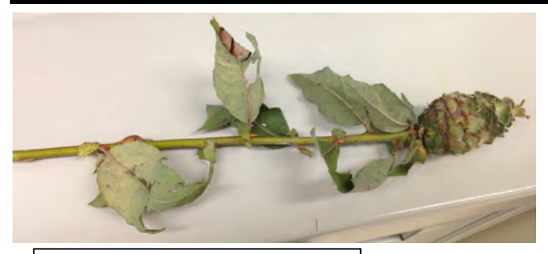
Willow branch with a Pine Cone Gall on the terminal bud