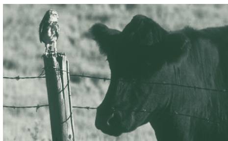
Species at risk, like this burrowing owl, can be compatible with agriculture