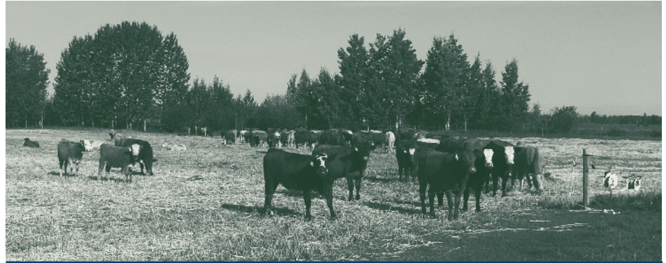
Practices like swath grazing help to extend the grazing season