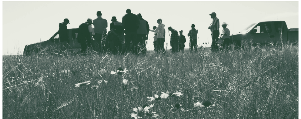
Producers expand their knowledge of sustainable grazing systems

At the same time these lands provide valuable economic benefits to cattle producers. Healthy rangeland is able to tolerate and recover from drought and has more stable forage production; allowing the producer to maintain a stable herd size and a stable cash flow. Grazing systems