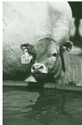
Ducks Unlimited Canada

WEBS is funded mainly through Greencover Canada, a five-year, $110-million federal initiative to help producers improve grassland management, protect water quality, reduce greenhouse gas emissions and enhance habitat. Ducks Unlimited Canada is a national partner in the study, contributing $1.25 million of the total cash funding. For more information on WEBS, visit http://www.agr.gc.ca/env/greencover-verdir/ .