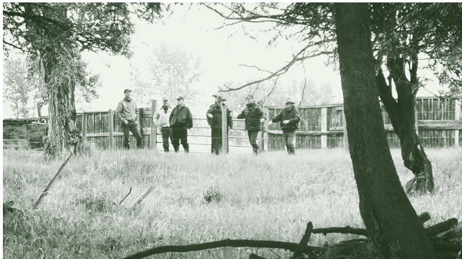
G. Stalker/M.D. of Rocky View

Stalker cites many examples of how groups in his area are contributing to those goals. For instance, he says, "Every year, the Farmers of the Elbow Watershed have been putting in what they call a 'habitat enhancement project'. The farmers take a portion of a riparian area [an area near a river, creek or wetland] that had been accessible to livestock and fence it to restrict livestock access. In some cases, the farmers provide an alternative water source which the cattle prefer over going down to the river to drink." The fenced-off areas have "dramatically" recovered, rapidly filling in with water-loving plants. He adds, "Healthy riparian areas act as a natural filter for the water