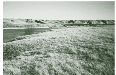
The Bow River near the Ronalene Bridge