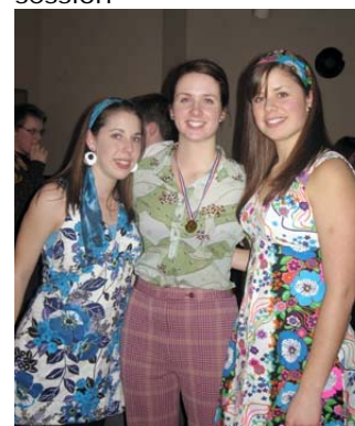
No "Back to the Future" conference would be complete without an array of costumes to decorate the retro dance that concluded the evening.