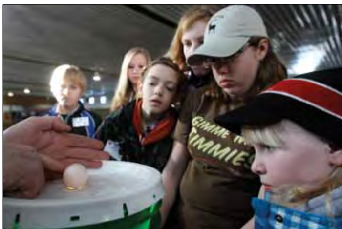
Learning how to grade eggs