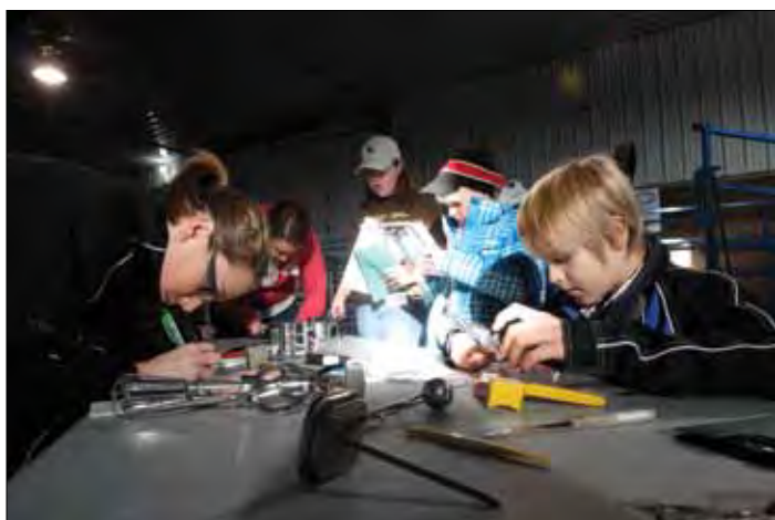
Household items identification