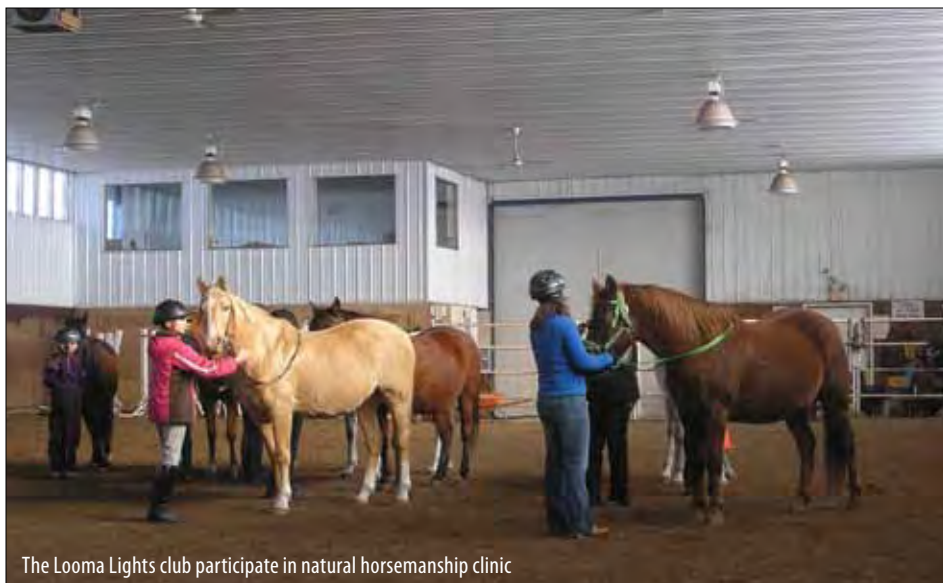
The Looma Lights club participate in natural horsemanship clinic