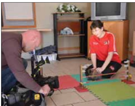
The initial video shoot.