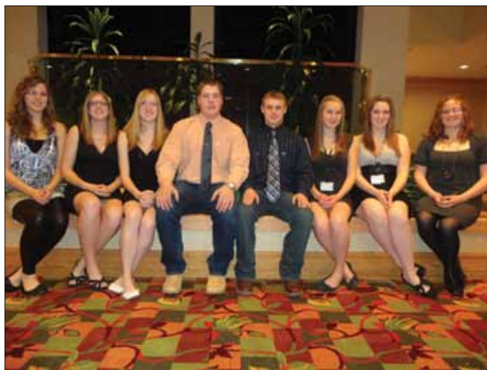
Hippology and Livestock Judging Teams in Denver

The hippology and livestock judging competitions themselves went very well. The hippology team definitely held our own! We placed fifth in judging, and sixth in the written exam, I.D. stations and team problem and are also proud to announce that the hippology team placed seventh out of 35 states in the High State Overall. Needless to say, we were ecstatic! The livestock judging team bused back and forth between Denver and Fort Collins for their judging workout and competition. They learned a great deal, especially about the unique way in which Americans give their reasons. Each member on the livestock team placed respectfully in a variety of classes.