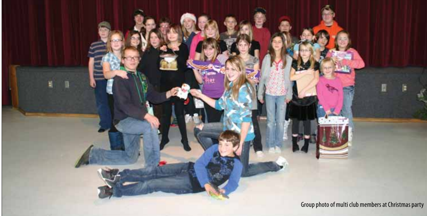
Group photo of multi club members at Christmas party

To say the least, things are really moving and shaking up in these hills, with the resounding cheers from our 4-H club! 🍀