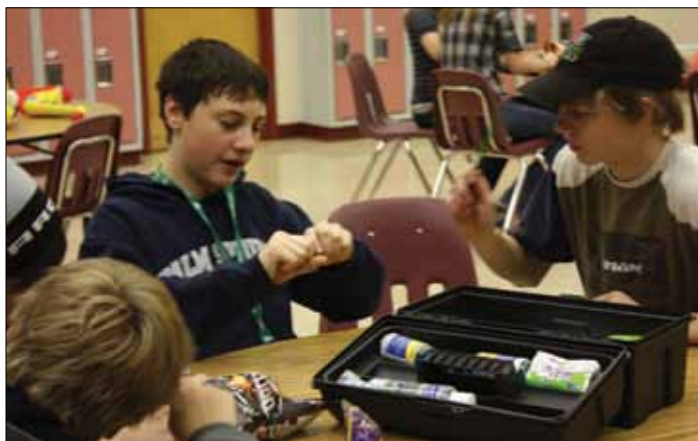
Fun at Winter Camp in the Peace

Perfect winter weather helped to make the Junior Winter Camp on February 3-4 a huge success. Held at the Fairview high