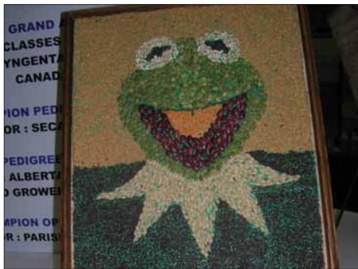
A TNT Multi Club creation made completely out of diverse colors and varieties of seeds. Creations were showcased at the North American Seed Fair.

One of the largest agricultural shows in Southern Alberta, Ag Expo, provided an opportunity for some great exposure for 4-H. TNT 4-H Multi Club members participated in the North American Seed Fair, one of the oldest Seed Fair's in Western Canada,