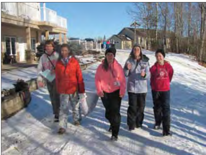
Delegates enjoy the Frosty Fun Weekend

If you have ever been to Camp Nakamun, you know of the many opportunities available on the north shore of Lake Nakamun. The annual winter camp, hosted February 3 to 5 became Festival de Carnaval for our intermediate and senior 4-H members. The counselors planned a full weekend of fun, packing the