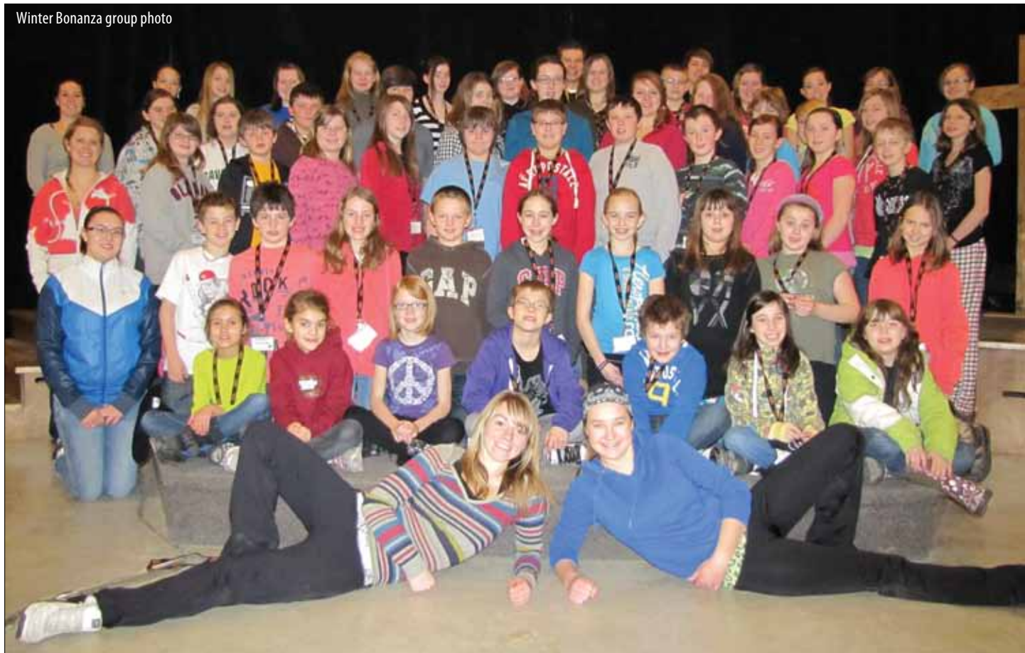
Winter Bonanza group photo

As we move in to spring, many clubs are finishing their club year with thoughts of achievement days are turning to summer activities. Be sure to check out all the great provincial programs that are available – from livestock shows to camping there is a program(s) for you!