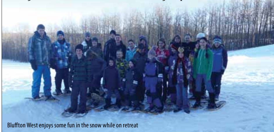
Bluffton West enjoys some fun in the snow while on retreat

Our club went on a retreat to the Alberta 4-H Centre on Dec 30 - 31, 2011. It was a fun event!! We took part in workshops on public speaking as well as first aid for animals and people. We held our club meeting while we were there. Other fun activities included games, snowshoeing, and movie night. A hot tub was also there for members to enjoy. The retreat was an awesome way for our members to have fun together!! The 4-H Centre at Battle Lake is a great place. 🍀