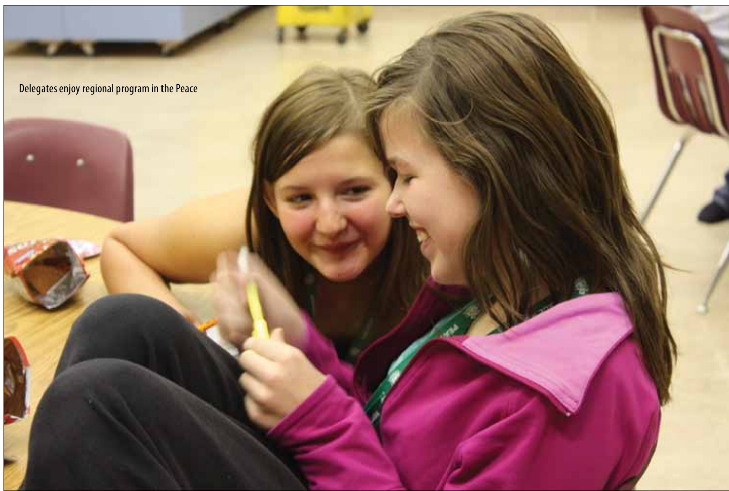
Delegates enjoy regional program in the Peace