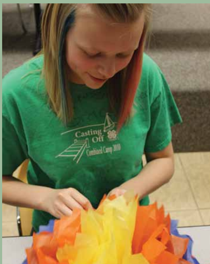
Airdrie Helping Hands Club made centerpiece decorations out of overstocked tissue paper.