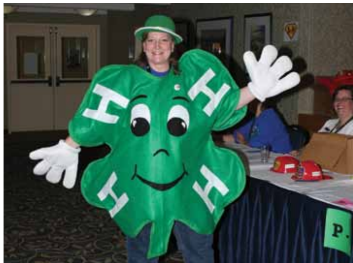
4-H leader arrives at “Heroes” dinner in style!

4-H Alberta Leaders' Conference is generously sponsored by Presenting Partner Rocky Mountain Dealerships, along with