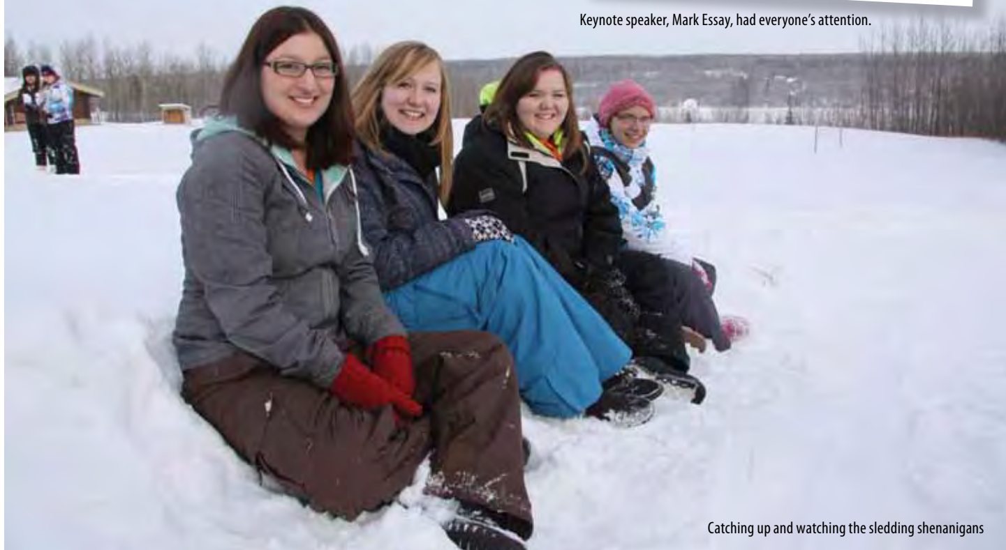
Catching up and watching the sledding shenanigans