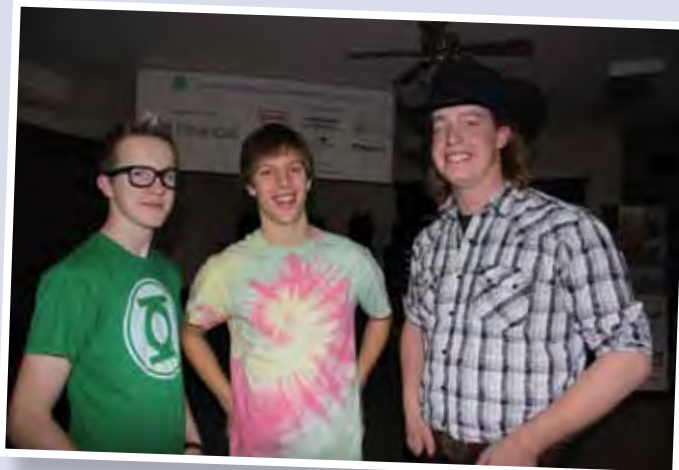
Lookin' sharp for the dance

Of course, any good winter conference wouldn't be complete without some team-building and group engagement outside. With just enough snow to get a crazy carpet to hit light speed, members made the most of the opportunity to take in the sun and fresh air.