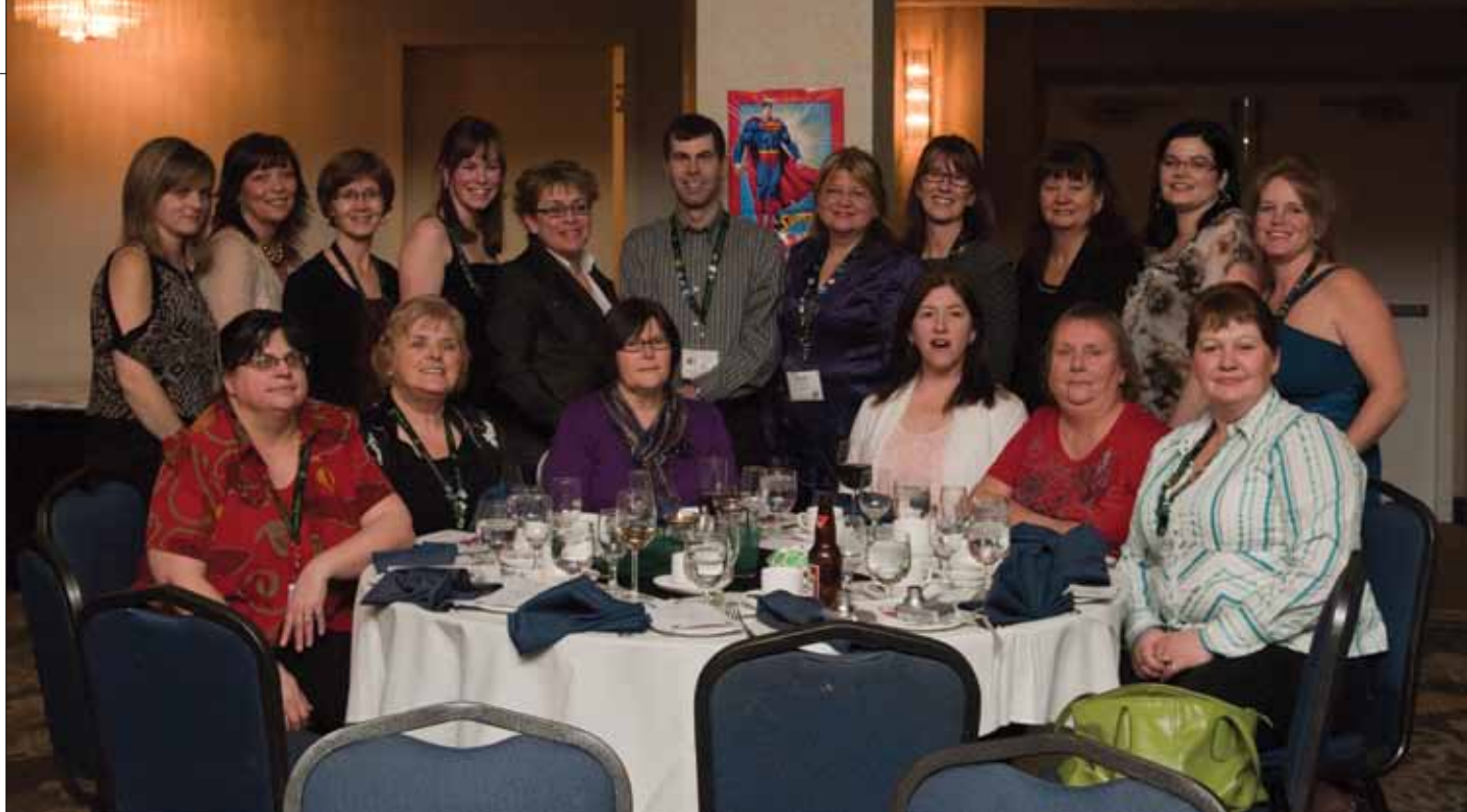
National 4-H Conference participants.