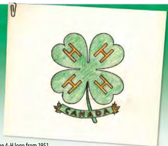
Early sketch of the 4-H logo from 1951

4-Hers from across Canada continue to get involved in other 4-H opportunities such as 4-H Youth Exchanges Canada and the W. Garfield Weston Foundation International Exchange – check out the 4-H Canada website for more information and to apply today!