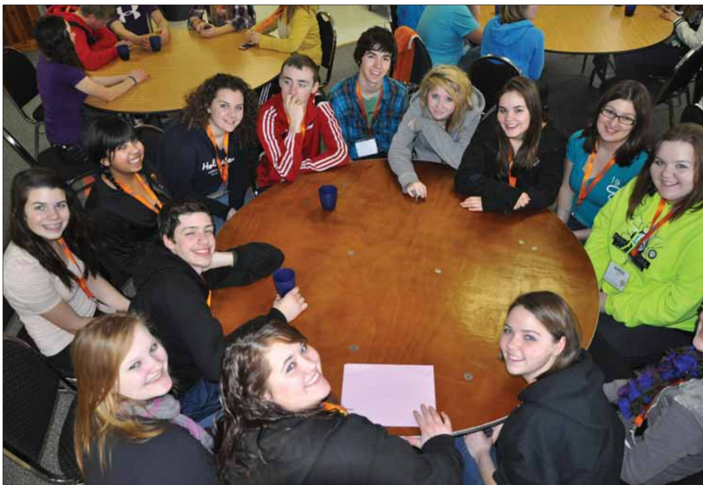
Key Members work on their presentation at SMC