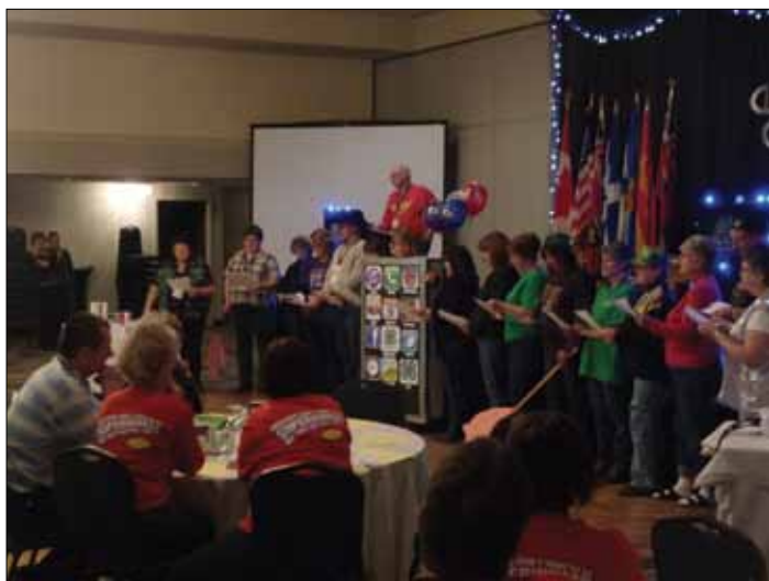
Representatives from West Central welcome leaders to the 2013 Leaders' Conference to be hosted by the West Central region.