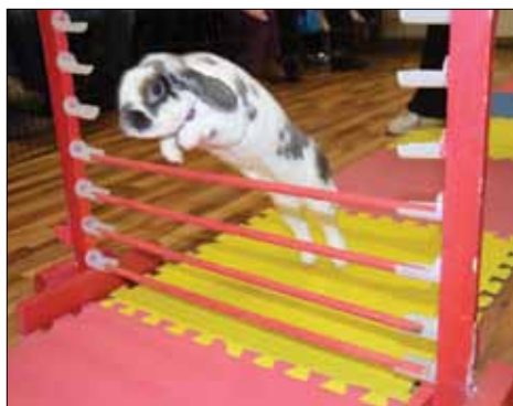
Practice makes perfect.