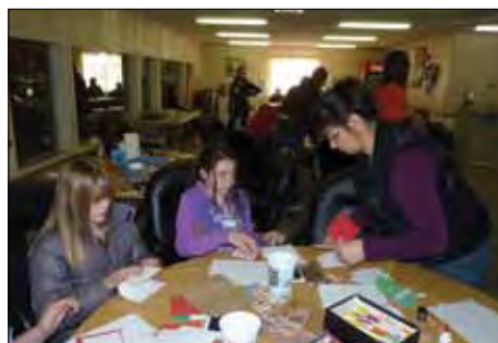
Delegates crafting cards at fun day!