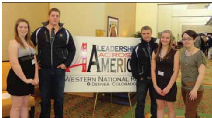
The Livestock Judging Team and I(r) in Denver.