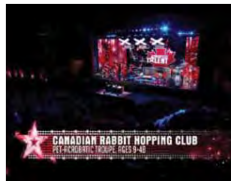
Look – We're on TV!!