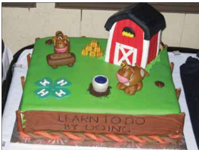
4-H cake sold at Farmer Smarter auction in December