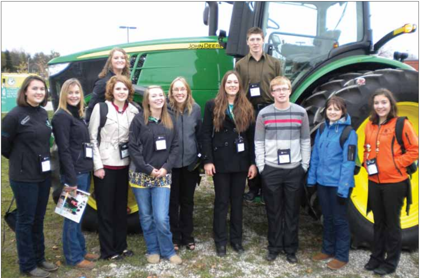
Posing after a John Deere demonstration