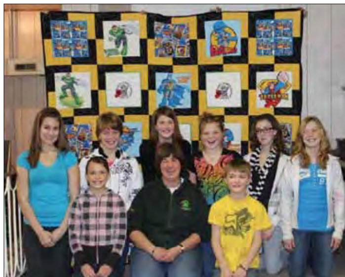
Cherhill 4-H Multi Club members

The final step was the binding and that found a couple of moms, members and myself hand sewing during the Christmas holidays and at January's monthly meeting. I finished with the label being done the night before the conference.