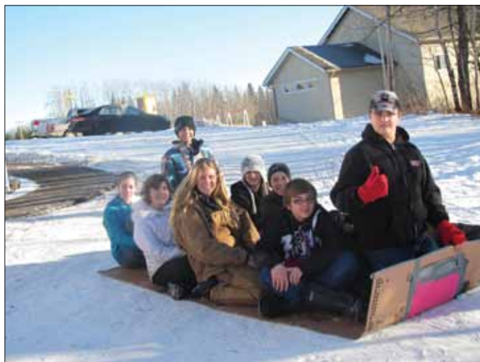
Infamous sled making competition at Frosty Fun

The Focus on 4-H committee looks forward to recognizing and honoring the achievements of members and leaders and having some fun July 5 to 8, 2012 in Barrhead. The program schedules