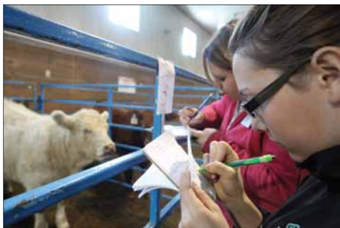
Carefully observing and taking notes