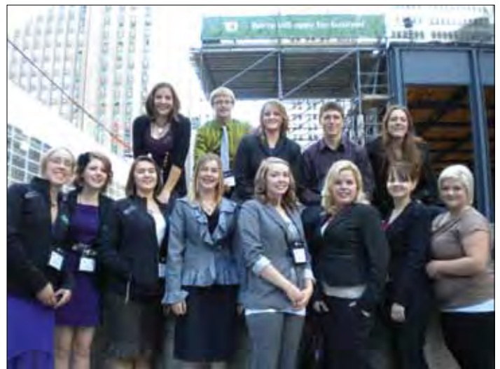
4-H Alberta National Conference attendees

The conference concluded with a banquet and Futurama themed dance on the final evening, with goodbyes following the next morning. Having the opportunity to travel to the National 4-H Conference was an amazing experience which I definitely will remember for a lifetime! 🍀