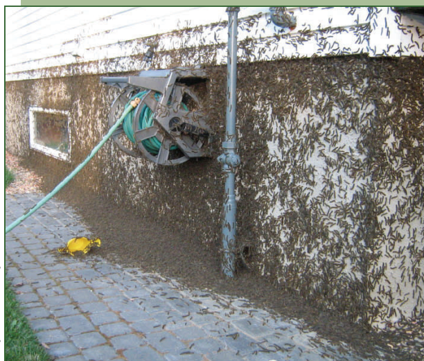
Forest tent caterpillar larvae blanket the exterior of a Fort McMurray home in the spring of 2007.

FTC outbreaks occur periodically in boreal ecosystems, sometimes covering vast areas in a very short period of time. A single egg mass contains around 175 eggs. Given favourable conditions, a large proportion of these eggs (approximately 60%) can hatch out the following spring. Assuming that this exponential growth is unopposed by external factors (climatic conditions, natural enemies, etc.) one female moth can give rise to almost one hundred million moths in just four years. If they all survived to reproduce, it