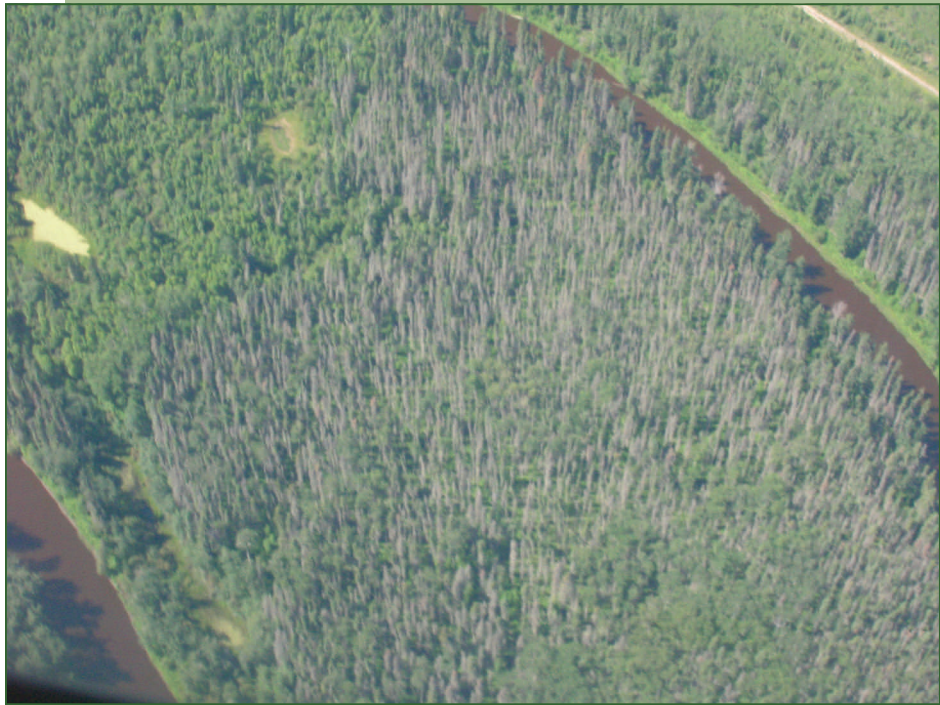
Aerial view of white spruce mortality along the Steen River, approximately 120 km north of High Level.

In 2004, there were 862 white spruce trees assessed in the two PSPs, and 180 (20.88 per cent) of them were living but considered declining in their overall health and appearance. Within the three year period, 98