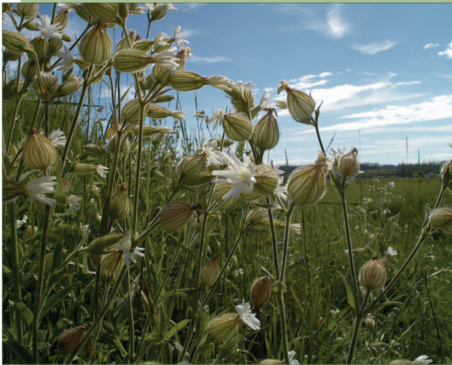
White cockle (Lychnis alba) infestation in the Chisholm area of northeastern Alberta.

Has white cockle moved north to stay? Is this another example where increased development and human activity have allowed another invasive species to expand its territory? Only time will tell.