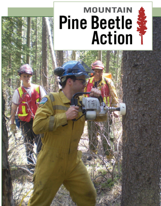
MPB crew taking samples with a gas drill and hole saw to forecast the beetle population in the area.