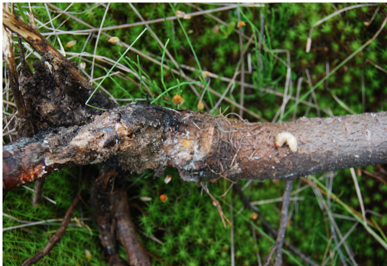
Warren's Root Collar weevil larva and feeding damage. (near Doig Tower)

Next time you come across some of these forest conditions, do a little digging and look a little harder. Chances are, one of these three common pests will be what you find.