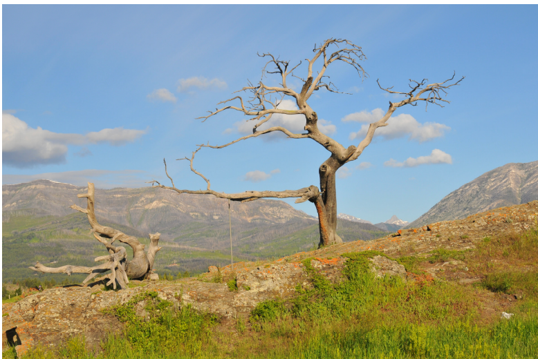
The Burmis Tree, a limber pine, in the Crowsnest Pass. Allegedly the most photographed tree in Alberta.

Whitebark and limber pine are both under threat from bugs and disease across much of their North American range. Most notably, the introduced white pine blister rust is responsible for high rates of mortality and in areas like Waterton Lakes National Park, and cone producing trees are becoming rare. Mountain pine beetle is devastating whitebark pine in the Greater Yellowstone Ecosystem because the warming climate is promoting a one year life cycle and low mortality at higher elevations. Mountain pine beetles are currently not a large threat in whitebark and limber pine habitat in Alberta but both species suffered high mortality during the last outbreak in the 1980s and the future is uncertain. The exclusion of fire disturbance and a warming climate are additional factors that interact with rust and beetles, but the impact of each factor individually is difficult to know and will vary by location. Despite a relatively large population of both species in the province, whitebark and limber pine were listed as Endangered in Alberta in 2009 due to the rapid decline and severe threat level. Federally, whitebark pine has been recommended for Endangered listing with a decision expected this summer. Limber pine may follow in the next few years.