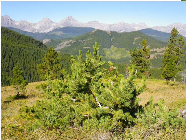
Photo below: Lone limber pine farther west than expected above the confluence of North and South Racehorse Creeks north of the Crowsnest Pass.

Photo right: Whitebark pine on the top of Table Mountain above Beaver Mines Lake in the Castle River area.