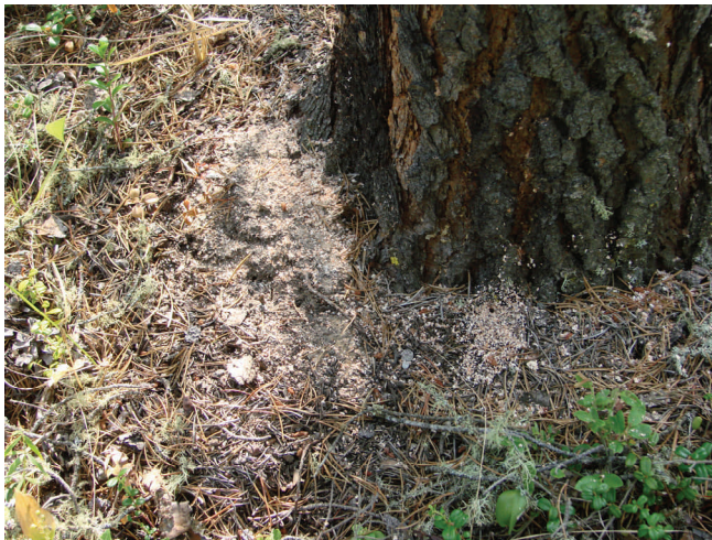
Boring dust at the base of a MPB attacked tree at a CFS pheromone site near the Hamlet of Smith