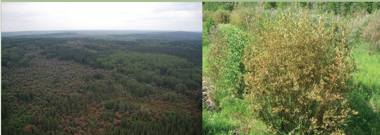
Large areas of willow leaf damage have been observed and reported in the Rainbow Lake, High Level, Fort Vermilion, Keg River and Zama areas. Populations of the willow leafminer ( Micrurapteryx salicifoliella ) have exploded and are the cause of this damage.