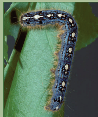
Spruce budworm and forest tent caterpillar larvae