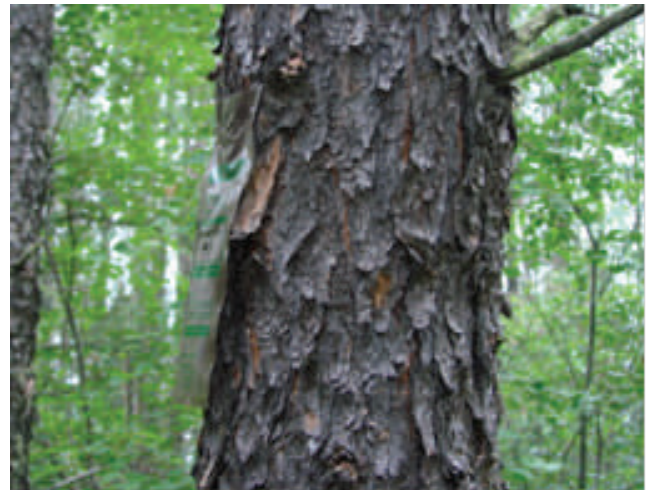
Dispersal bait near Spotted Horse Lake