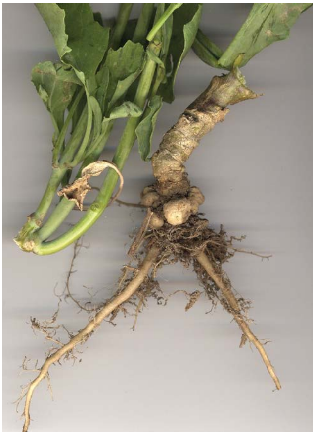
Figure 8. Root galls on canola due to phenoxy injury.

Phenoxy damage to canola may also induce galls on stem bases and roots (Figure 8). As with hybridization nodules, the phenoxy-induced galls will not decay rapidly like clubroot galls. Thickened, corky or split stem bases and curving stems are additional phenoxy symptoms that often occur in canola.