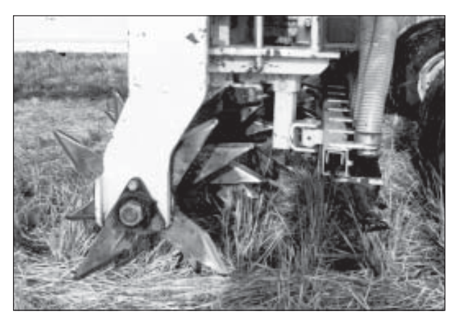
Figure 5. Aerway aerator

Aerway. The Aerway system consisted of a series of spikes mounted on an axle (Figure 5). A drop hose was mounted behind each spike set. The spikes were spaced 19 cm (7.5 in) apart and penetrated the soil creating a soil aeration effect. The drop hoses then delivered the liquid to the soil surface, and to the spike holes in the soil surface.