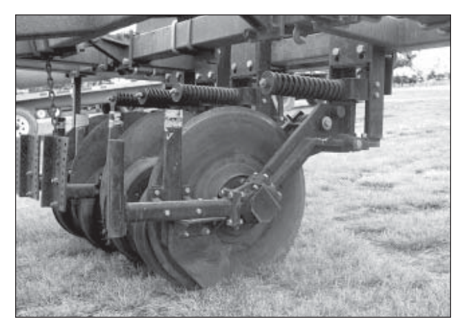
Figure 1. Yetter Avenger injector

Yetter. The Yetter Avenger injector system (Figure 1) consisted of a 64 cm (25 in) diameter offset disk angled at 5 degrees to the direction of travel. A 38 cm (15 in) diameter rubber cleaning wheel was mounted to the exposed side of the disk and a metal scraper was mounted on the protected side of the disk. A drop tube was located directly behind the offset disk. The Yetter included a set of concave closing disks attached to the frame behind the drop hose. The closing disks were removed during testing as they produced a lot of soil disturbance.