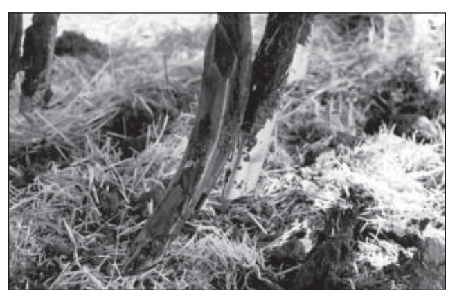
Figure 4. Spike injector

Spike. The Spike injector system had a 5 cm (2 in) wide spike opener mounted on a 5 cm (2 in) wide C-shank (Figure 4). A metal tube was mounted directly behind the spike to hold a drop hose.