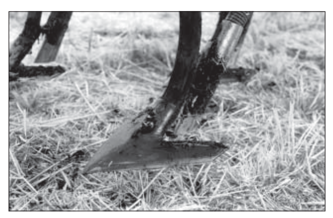
Figure 3. Sweep injector

Sweep. The Sweep injector system consisted of a 26.7 cm (10.5 in) wide sweep opener mounted on a 5 cm (2 in) wide C-shank (Figure 3). A metal tube was mounted directly behind the sweep to hold a drop hose.