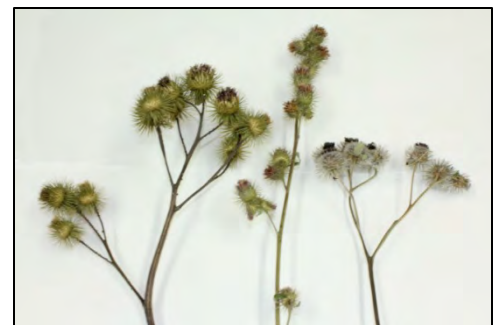
Great Burdock, Lesser Burdock, Woolly Burdock

Woolly Burdock ( Arctium tomentosum ) flower heads are less than 2.5 cm across, densely cobwebby and flowers clumped along stem with branches in groups