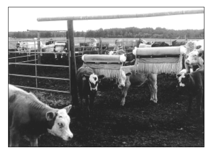
Figure 3. Backrubber oiler

Shelters, similar to the ones described for cattle protection, can also provide horses with a refuge for temporary relief from black fly attack. Commercial repellents are available and should be used as directed on the label. Application of white petroleum jelly to the inside of horses' ears is effective in reducing attack by species that bite the ears.