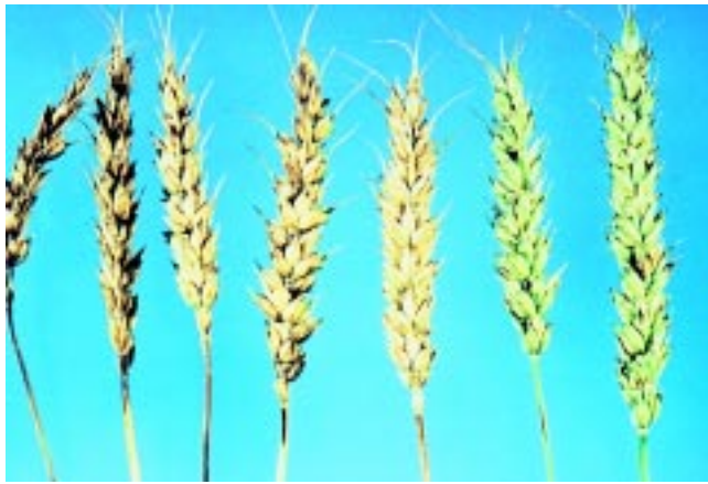
Figure 2. Heads of wheat grown in copper deficient soil become bleached and then turn grey; stems of some cultivars darken significantly due to melanosis.

Prior to 1985-88, the sole criteria for determining whether a soil was Cu deficient or not was the critical level of 0.2 ppm DTPA extractable Cu. In other words, if a soil test indicated more than 0.2 ppm Diethylenetriaminepentaacetic acid (DTPA) extractable Cu, then the soil was determined to have sufficient Cu for normal crop growth. This approach did not distinguish between those crops with high Cu needs, such as wheat and barley, and those that could still give optimal yields at very low Cu levels, such as canola and rye.