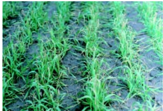
Figure 9. Herbicide wheat interaction (leaf tip burning) on copper deficient soil.

Interestingly, this year (1999), nickel (Ni) has been shown to be essential for cereal crops. Under nickel deficient conditions, barley plants fail to produce viable grain.