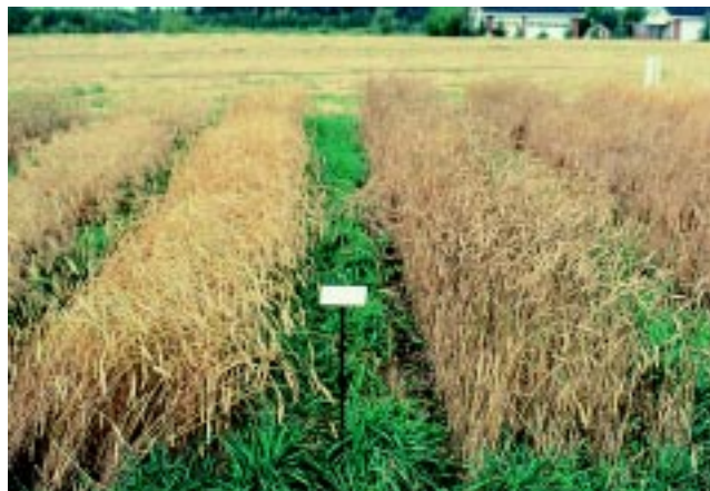
Figure 12. Upright (empty-headed) Park wheat at right is grown on 0.6 ppm (DTPA Cu) soil. At left, same crop grown on soil amended with 12 lb Cu/ac as \text{CuSO}_4 . Yields were 19 bu/ac vs 51 bu/ac. Almost a triple yield increase and a quality jump from Sample to #1.

* Copper sulphate applied at 10 lb of actual copper per acre.