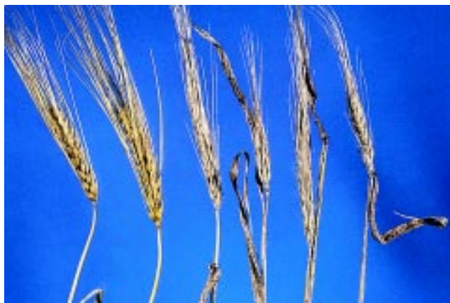
Figure 10. Left – normal barley. Right – severe copper deficiency.

For grain crops, the usual order of sensitivity (response) to Cu deficiency is winter wheat>spring wheat>flax>barley>oats>peas>triticale>rye. Canola has not shown Cu deficiency symptoms or responded to Cu fertilizer additions when grown on soils considered very copper deficient for wheat or barley. Many other Alberta crops have yet to be evaluated for their sensitivity (response) to Cu nutrition (Figures 10 and 11).