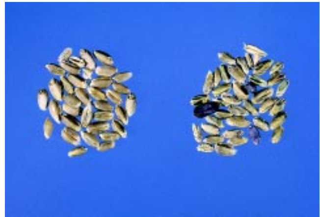
Figure 3. Left – normal wheat. Right – shrivelled wheat kernels (frosted bran) and ergots due to a copper deficiency.

The probability of correct diagnosis increases dramatically if overall fertility management, soil type, herbicide used, livestock manure, delayed crop maturity, soil copper profile and past observations of copper induced disease, particularly ergot (Table 5), or some of the many Cu deficiency symptoms common in wheat and barley are taken into account (Figure 3).