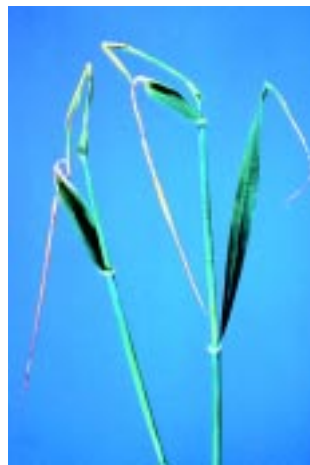
Figure 6. Pigtail (whip-tail) of barley shows copper deficiency.

Running a 20 ft. (6 m) strip of copper fertilizer at a 10 lb actual copper per acre rate in a diagonal across the field, which likely has variable copper levels, will show up “sufficient” and “deficient” areas in succeeding wheat and barley crops (Figures 6 and 7).