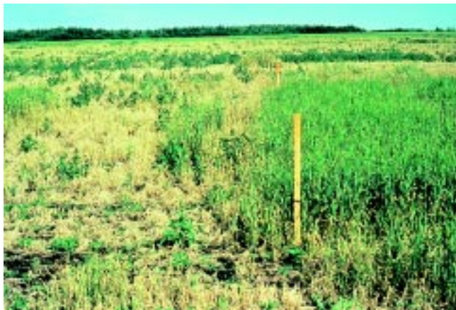
Figure 4. Dead barley at left is due to severe copper deficiency. Barley at right will mature on peat soil since copper fertilizer was applied.

Other indications of Cu deficiency include consistently low bushel weights, especially in barley, and high protein (>18%). A lack of Cu hinders the movement of carbohydrates to form starch in the maturing grain head. Hence, shriveled grain, low bushel weight and concentrated protein result since there is relatively little starch present (Figures 4 and 5).