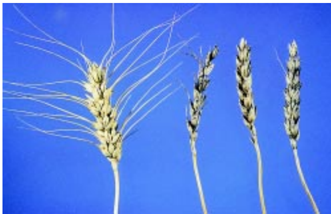
Figure 5. Left – normal wheat. Right – wheat with severe copper deficiency symptoms.