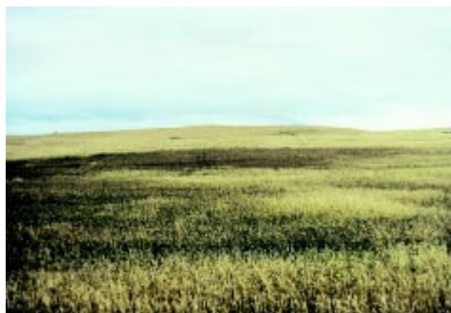
Figure 1. Copper deficient (melanotic) "patch" in Park wheat.

Research has now identified Cu deficiencies in the Black, transitional Gray-Black and Dark Brown soil zones. The extent of the deficiencies on these soils is not well defined, but it is estimated that approximately three million acres are significantly Cu deficient.