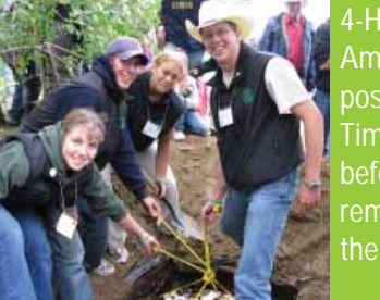
Ambassadors pose with the Time Capsule before it is removed from the ground.

The Time Capsule Celebration was the largest Provincial 4-H event in over 10 years. The event theme: "Yesterday, Today, Forever" signifies the vast history of 4-H in this province as well as the positive direction the program is heading. It was a family event in every aspect, as young and old alike shared laughter, a glimpse of the past, and memories that will last a lifetime.