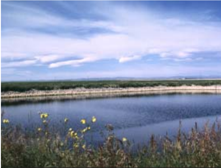
Dugouts are an important water source on the Prairies. It is necessary to maintain the best water quality possible

Continuous year round aeration through diffusion can offset these problems.