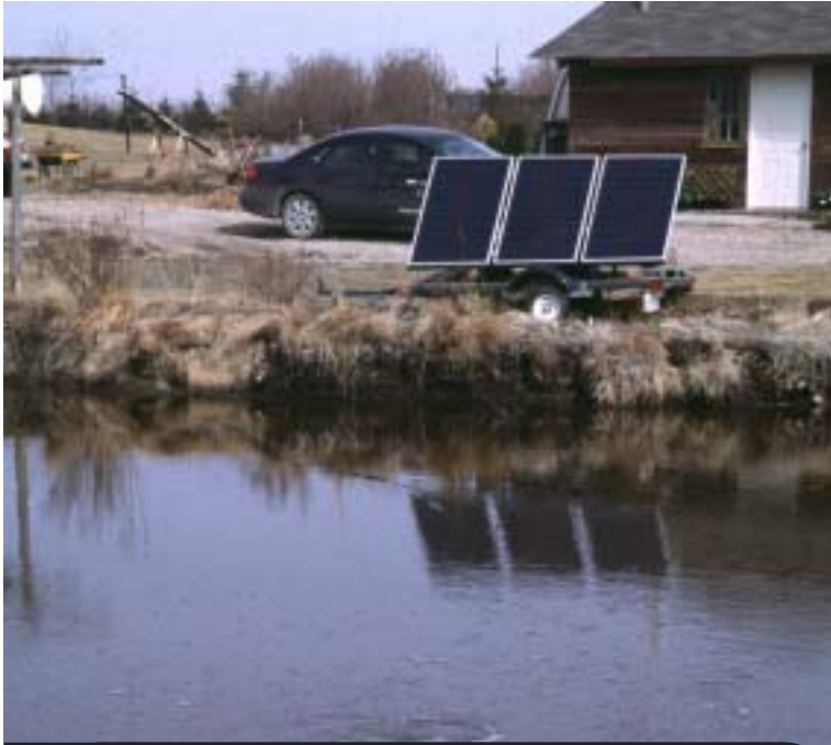
Solar powered aeration installed on a trailer allows for mobility