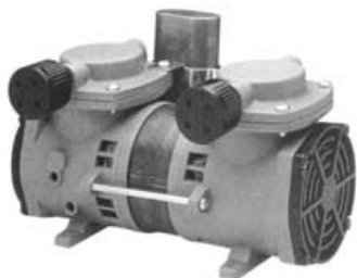
Manufacturer Thomas Model 2107CEF18 Weight 3.1kg