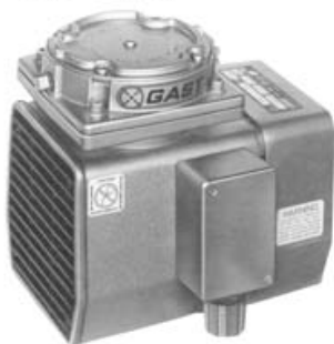
Manufacturer Gast Model DOA-P101-AA Weight 6.6kg