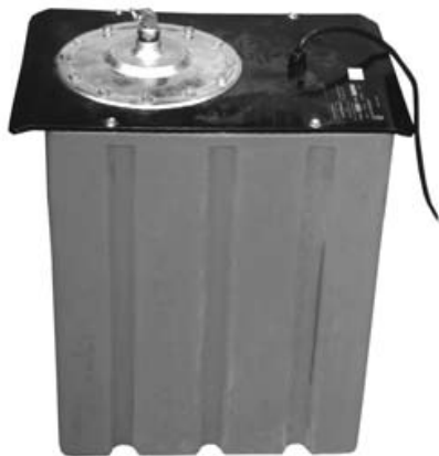
Manufacturer Koenders Model EL2 Weight 40.0kg

Koenders EL2 is shown to a 10 : 1 scale, all other compressors are shown to a 4 : 1 scale