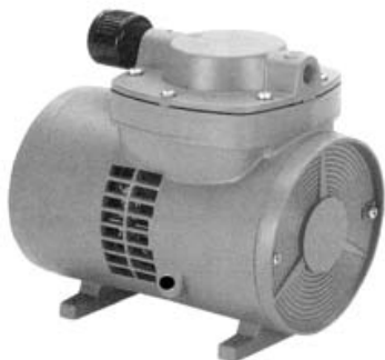
Manufacturer Thomas Model 917CA18 Weight 4.9kg