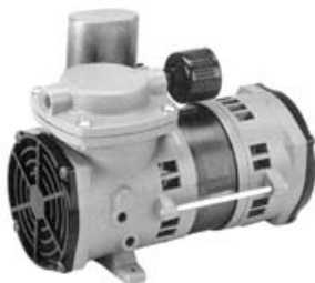
Manufacturer Thomas Model 107CEF18 Weight 2.7kg