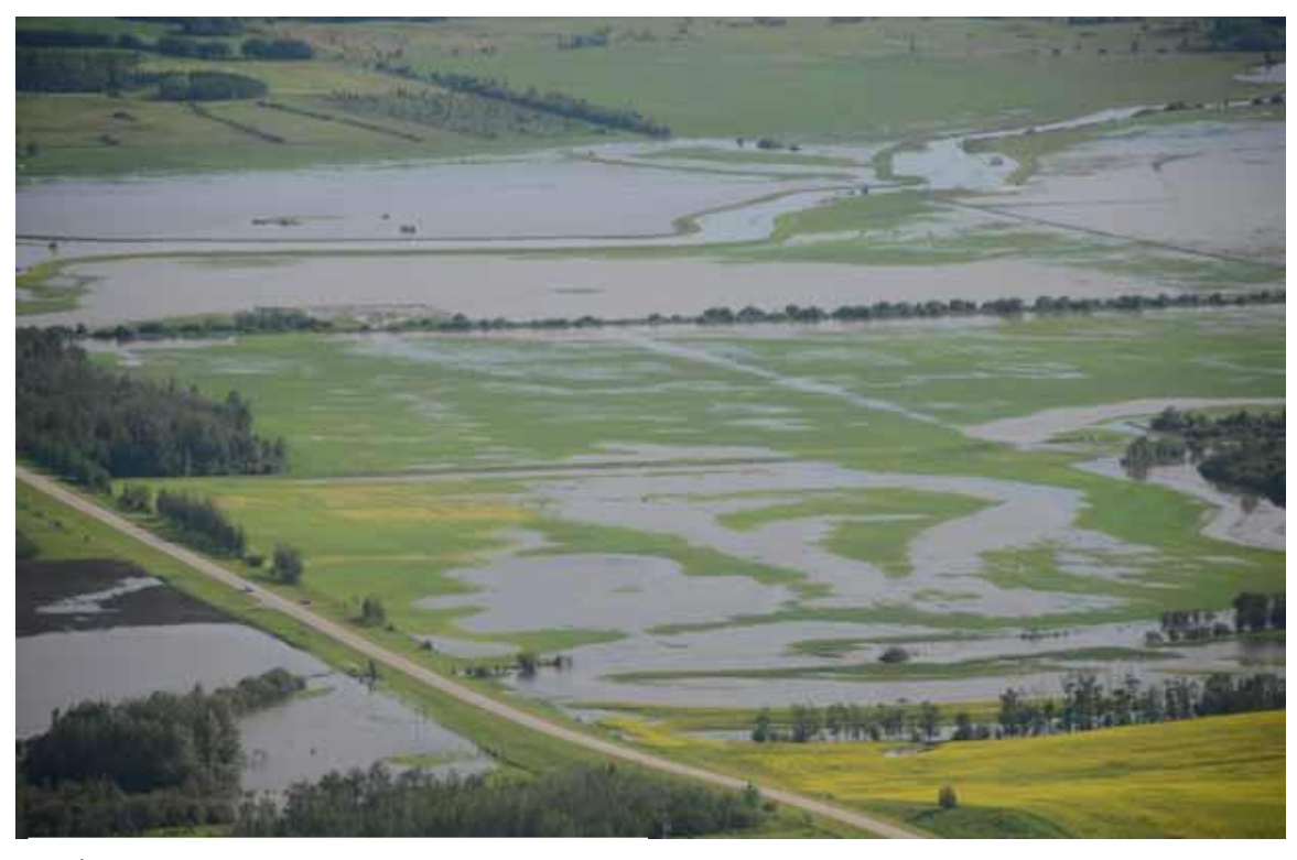
July 22 2011 County of Barrhead edmontonjournal.com