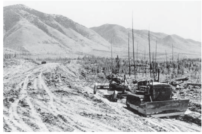
Cat Creek portion of Forestry Trunk Road, Highwood District, Bow River Forest, 1950. Note snags from 1936 fires

and prevention and suppression of fires on forested lands in the Yellow Area.