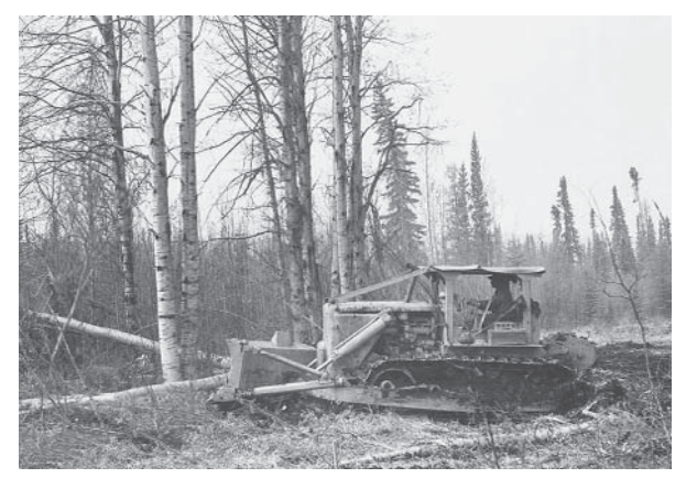
Building the Forestry Trunk Road, Mist Creek, Bow River Forest, 1951

The Green Area map showed the reserved forest in green, potential agricultural lands in yellow, and predominantly agriculturally-suited lands in white. The Green Area was intended to reserve forested lands from settlement. The Yellow Area was also reserved from settlement. at least until soil surveys were done and lands suitable for agriculture released in an orderly way. The AFS was thus able to focus its efforts on the Green Area, and to base its forest management planning on those lands most likely to remain forested. The AFS was also responsible for timber