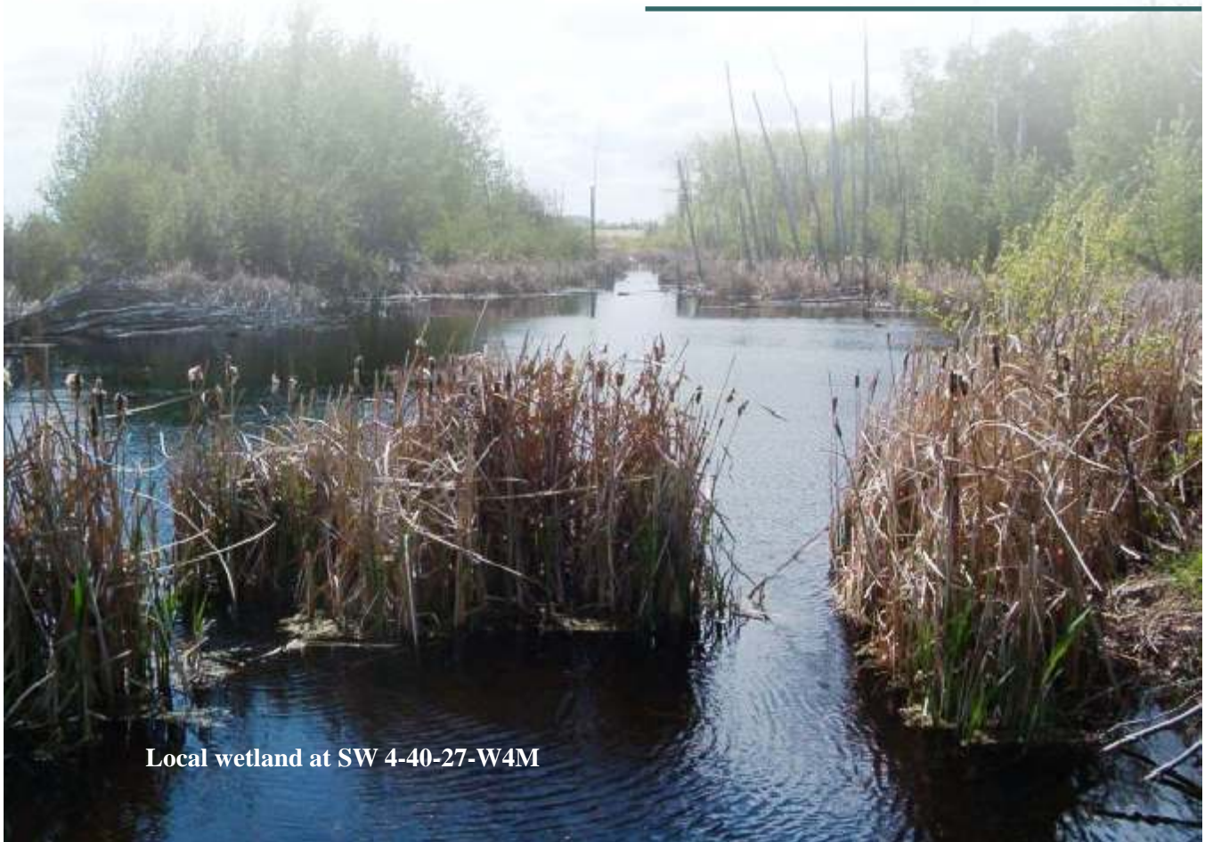
Local wetland at SW 4-40-27-W4M

“Groundwater is an enduring mystery...It has hidden itself below the soils of the Canadian plains and nurtured those fortunate enough to find and tap it.” Grant MacEwan