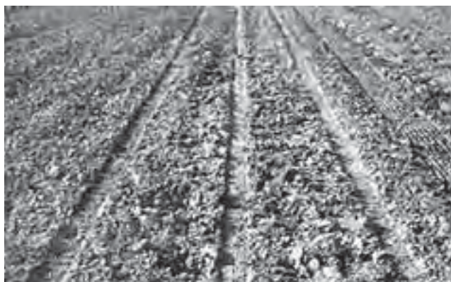
FIGURE 2. Jeannotte Tire Tracks Behind the Disker Seeder.

The tire left a compacted track about 6 in (154 mm) wide (FIGURE 2), which was no longer visible after harrowing or packing.