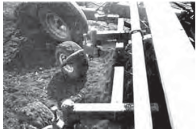
FIGURE 3. Operating in Wet Loam Soil.

The tires easily rode over heavy trash and clumps of straw.